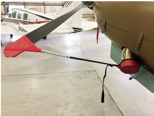
Siai Marchetti 1019 Prop Tie-Exhaust Covers

This cover type is made from Silver Acrylic Sunbrella canvas and is 100% lined with a soft and smooth microfiber. Bruce's Custom Covers developed this material combination especially for aircraft protection. The outer material is medium weight and treated for water resistance, UV resistance and anti-static buildup. The inner lining is a very soft and smooth microfiber to prevent scratching. The material is very reflective, and tests show that the cabin interior temperature can be reduced to near-ambient temperature on the hottest of days. It is water, ice and snow repellent, yet breathable to allow moisture to escape from between the cover and the aircraft surface.