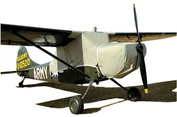
Cessna L-19 Canopy & Engine Covers (similar to Siai Marchetti 1019)