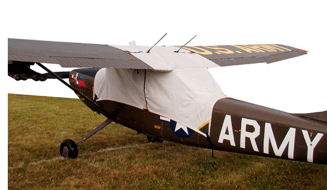
L-19 Canopy Cover (similar to Siai Marchetti 1019)

This cover type is made from Silver Acrylic Sunbrella canvas and is 100% lined with a soft and smooth microfiber. Bruce's Custom Covers developed this material combination especially for aircraft protection. The outer material is medium weight and treated for water resistance, UV resistance and anti-static buildup. The inner lining is a very soft and smooth microfiber to prevent scratching. The material is very reflective, and tests show that the cabin interior temperature can be reduced to near-ambient temperature on the hottest of days. It is water, ice and snow repellent, yet breathable to allow moisture to escape from between the cover and the aircraft surface.