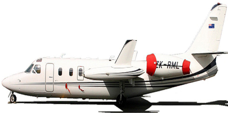
Jet Commander Engine Covers

The Israel Aircraft Industries Jet Commander 1121 Bikini Style Engine Covers are a single-piece design using a soft and smooth stretchy and fabric. The cover stretches tightly over both the intake and exhaust, installing quickly and easily. These covers are designed to be used as hangar dust covers and have a useful life of approximately one year.