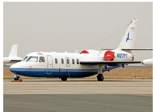
Engine Covers & Cockpit HeatShields