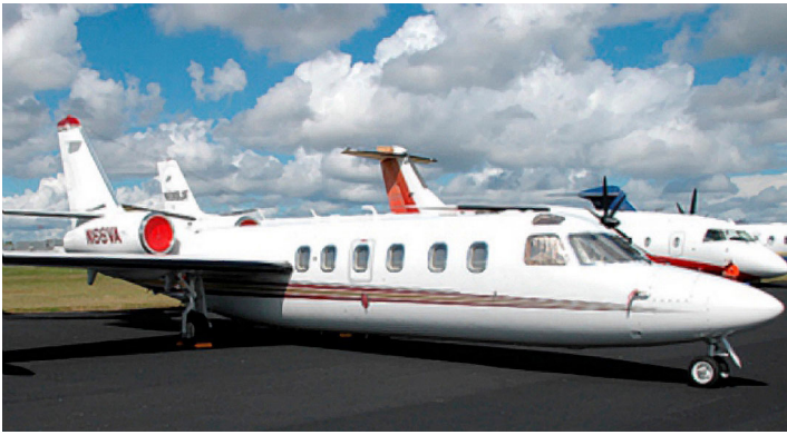
Westwind Engine Intake Plugs