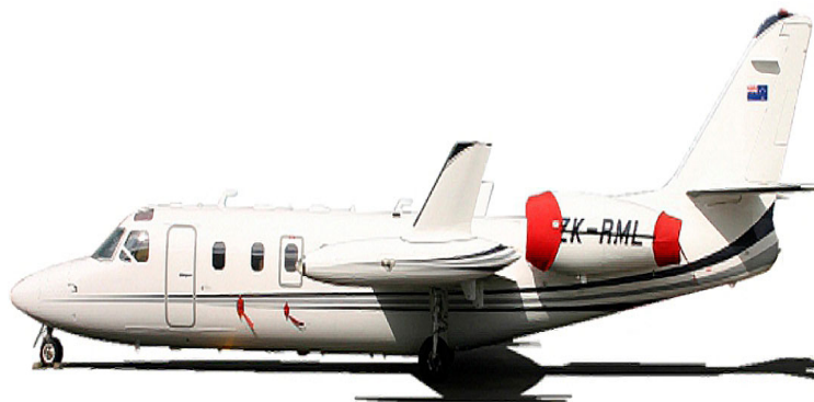
Jet Commander Engine Covers