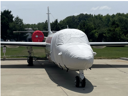
IAI 1124 Cockpit/Nose Cover Extended Aft Over Entry Door