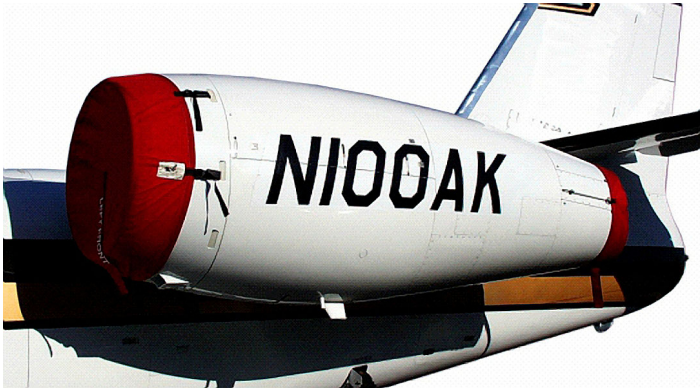
IAI Astra Engine Cover Set

instructions. The aircraft's registration number can be silkscreened onto the cover for an extra charge.