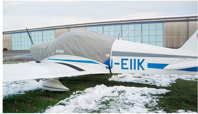
Robin R.2160 Canopy/Engine Cover