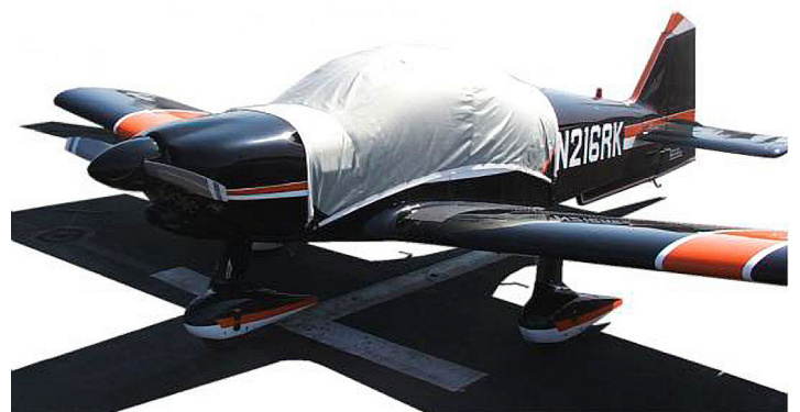
Robin R.2160 Canopy Cover