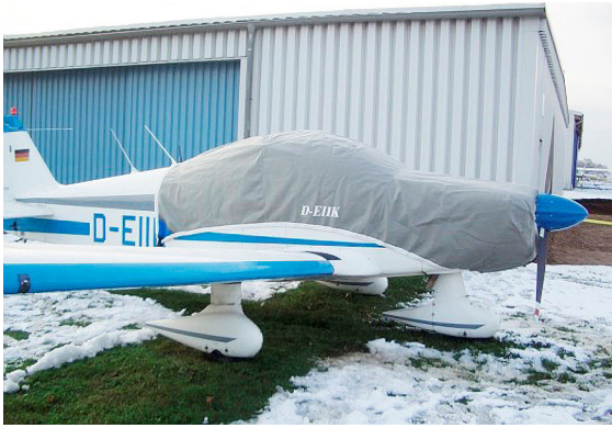
Robin R.2160 Canopy/Engine Cover

the hottest of days. It is water, ice and snow repellent, yet breathable to allow moisture to escape from between the cover and the aircraft surface.