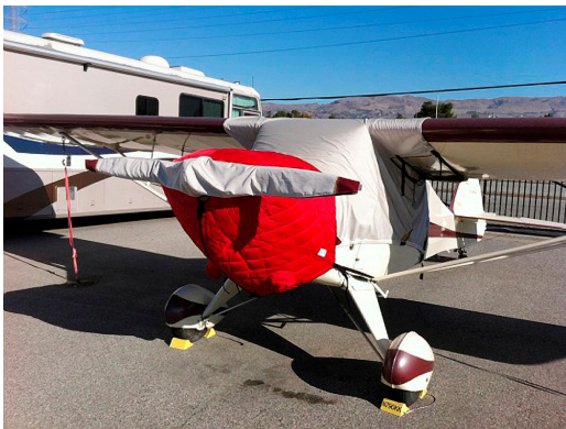
Taylorcraft Insulated Engine Cover, Prop and Canopy Covers

This cover type is made from Silver Acrylic Sunbrella canvas and is 100% lined with a soft and smooth microfiber. Bruce's Custom Covers developed this material combination especially for aircraft protection. The outer material is medium weight and treated for water resistance, UV resistance and anti-static buildup. The inner lining is a very soft and smooth microfiber to prevent scratching. The material is very reflective, and tests show that the cabin interior temperature can be reduced to near-ambient temperature on the hottest of days. It is water, ice and snow repellent, yet breathable to allow moisture to escape from between the cover and the aircraft surface.