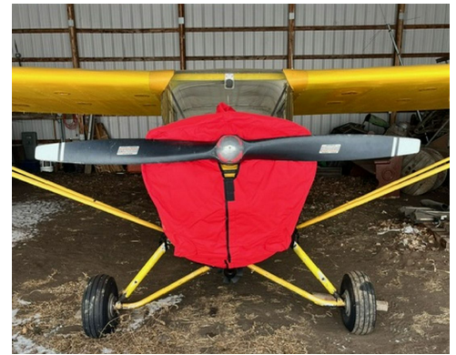
Aeronca 11AC Chief Insulated Engine Cover