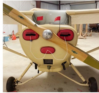
Aeronca 11AC Chief Engine Plugs