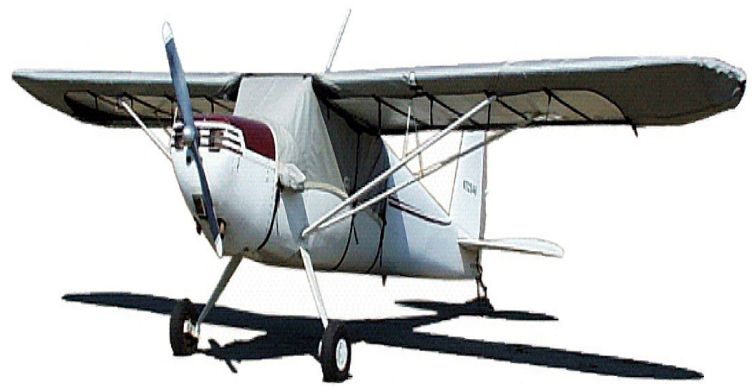
Cessna 120 Canopy Cover & Wing Covers