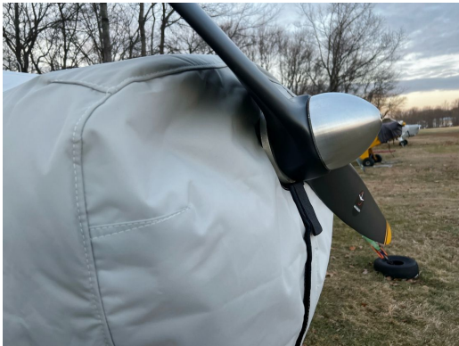
Aeronca Chief 11AC, Super Chief 11CC Insulated Engine Cover

This cover type is made from Silver Acrylic Sunbrella canvas and is 100% lined with a soft and smooth microfiber. Bruce's Custom Covers developed this material combination especially for aircraft protection. The outer material is medium weight and treated for water resistance, UV resistance and anti-static buildup. The inner lining is a very soft and smooth microfiber to prevent scratching. The material is very reflective, and tests show that the cabin interior temperature can be reduced to near-ambient temperature on the hottest of days. It is water, ice and snow repellent, yet breathable to allow moisture to escape from between the cover and the aircraft surface.