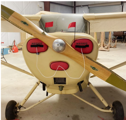
Aeronca 11AC Chief Engine Plugs