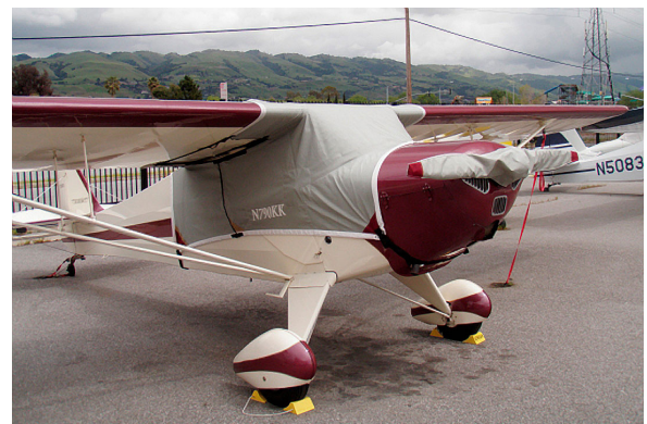
Taylorcraft Over-Top Canopy Cover