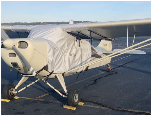
Aeronca Chief 11BC Extended Over-Top Canopy Cover

This cover type is made from Silver Acrylic Sunbrella canvas and is 100% lined with a soft and smooth microfiber. Bruce's Custom Covers developed this material combination especially for aircraft protection. The outer material is medium weight and treated for water resistance, UV resistance and anti-static buildup. The inner lining is a very soft and smooth microfiber to prevent scratching. The material is very reflective, and tests show that the cabin interior temperature can be reduced to near-ambient temperature on the hottest of days. It is water, ice and snow repellent, yet breathable to allow moisture to escape from between the cover and the aircraft surface.