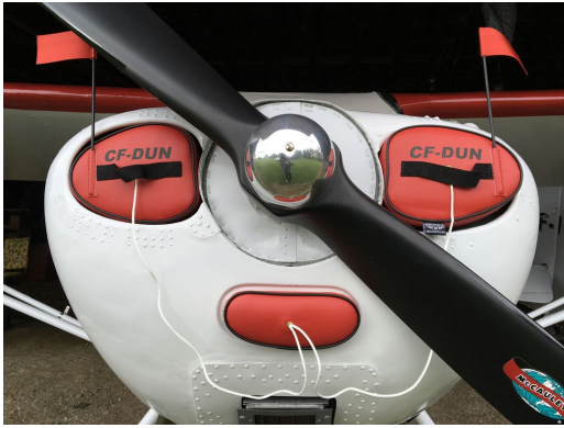
Aeronca 11AC Engine Inlet Plugs

Engine Inlet Plugs are custom fit for your Aeronca Chief 11AC, Super Chief 11CC intakes, made with heavy-duty vinyl material, and stuffed with a single block of sculpted urethane foam. Each plug has a zipper that allows the foam to be removed and dried if necessary. Engine plugs have warning flags that are visible from the cockpit or 'remove before flight' streamers sewn onto the face of the plugs. Most plugs are imprinted with the aircraft registration number in black for an extra charge. Storage bag NOT included. Engine plugs may be inserted after flight when the engine is still warm. Engine Inlet Plugs are commonly referred to as Cowl Plugs, Intake Plugs, Cowl Blocks, Engine Blocks, and Engine Bungs.