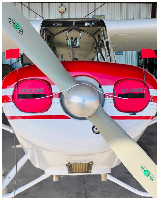
Aeronca 7AC Engine Inlet Plugs

Engine Inlet Plugs are custom fit for your Aeronca Chief 11AC, Super Chief 11CC intakes, made with heavy-duty vinyl material, and stuffed with a single block of sculpted urethane foam. Each plug has a zipper that allows the foam to be removed and dried if necessary. Engine plugs have warning flags that are visible from the cockpit or 'remove before flight' streamers sewn onto the face of the plugs. Most plugs are imprinted with the aircraft registration number in black for an extra charge. Storage bag NOT included. Engine plugs may be inserted after flight when the engine is still warm. Engine Inlet Plugs are commonly referred to as Cowl Plugs, Intake Plugs, Cowl Blocks, Engine Blocks, and Engine Bungs.