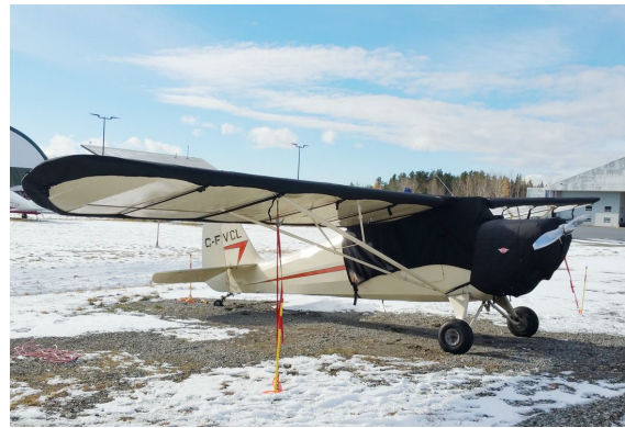
Aeronca Chief 11AC Canopy, Insulated Engine, & Wing Covers