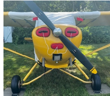
Aeronca 11CC Super Chief Engine Plugs, Extended Canopy Cover (also covers gas caps)