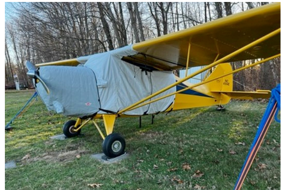
Aeronca Super Chief 11CC Extended Over-Top Canopy Cover, Insulated Engine Cover