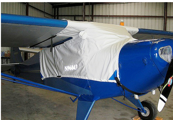
Taylorcraft BC12-D Over-the-top Canopy Cover

This cover type is made from Silver Acrylic Sunbrella canvas and is 100% lined with a soft and smooth microfiber. Bruce's Custom Covers developed this material combination especially for aircraft protection. The outer material is medium weight and treated for water resistance, UV resistance and anti-static buildup. The inner lining is a very soft and smooth microfiber to prevent scratching. The material is very reflective, and tests show that the cabin interior temperature can be reduced to near-ambient temperature on the hottest of days. It is water, ice and snow repellent, yet breathable to allow moisture to escape from between the cover and the aircraft surface.