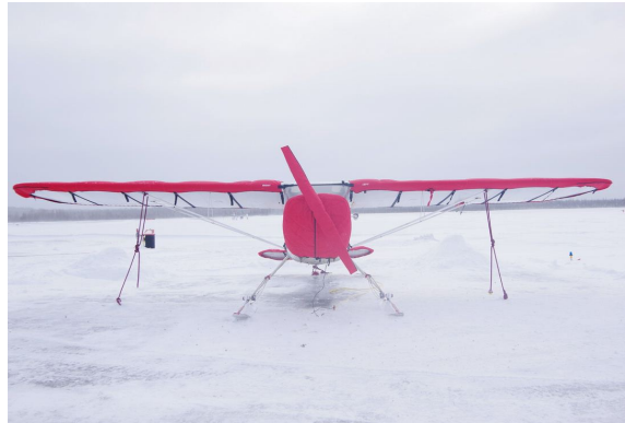
Cessna 120 Insulated Engine & Prop Covers, Wing & Tail Covers