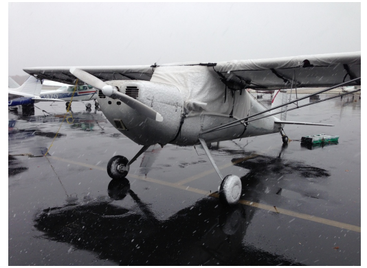
Cessna 120/140 Canopy and Wing Covers