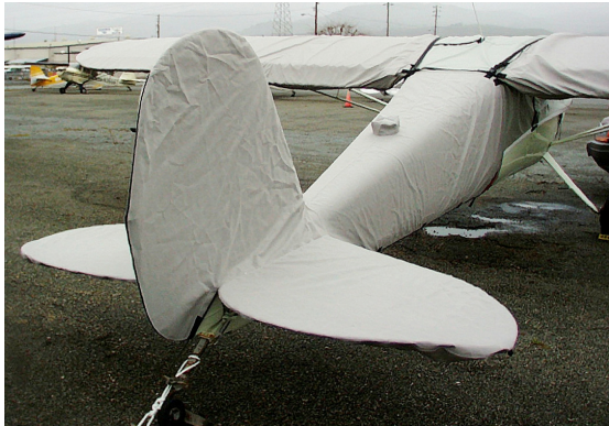
Cessna 120 Empennage Cover

WINTER USE MATERIAL - Made with Solution-Dyed Polyester fabric, this option is intended for seasonal use to aid in deicing, rain mitigation, or for occasional travel. The material is lighter and more compact, but more susceptible to UV damage and may have a shorter useful life if used continuously outside than the all-year use material.