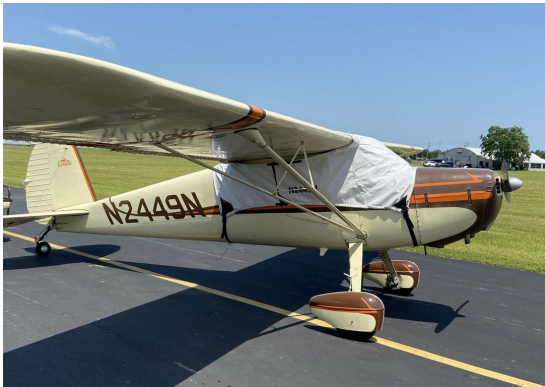
Cessna 140 Over-Top Canopy Cover

This cover type is made from Silver Acrylic Sunbrella canvas and is 100% lined with a soft and smooth microfiber. Bruce's Custom Covers developed this material combination especially for aircraft protection. The outer material is medium weight and treated for water resistance, UV resistance and anti-static buildup. The inner lining is a very soft and smooth microfiber to prevent scratching. The material is very reflective, and tests show that the cabin interior temperature can be reduced to near-ambient temperature on the hottest of days. It is water, ice and snow repellent, yet breathable to allow moisture to escape from between the cover and the aircraft surface.