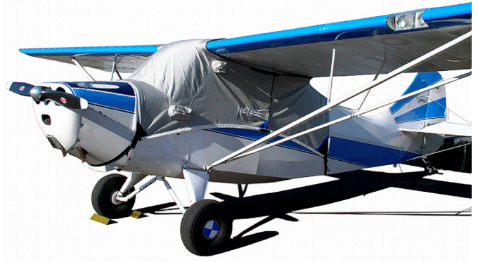
Aeronca Champ Canopy Cover