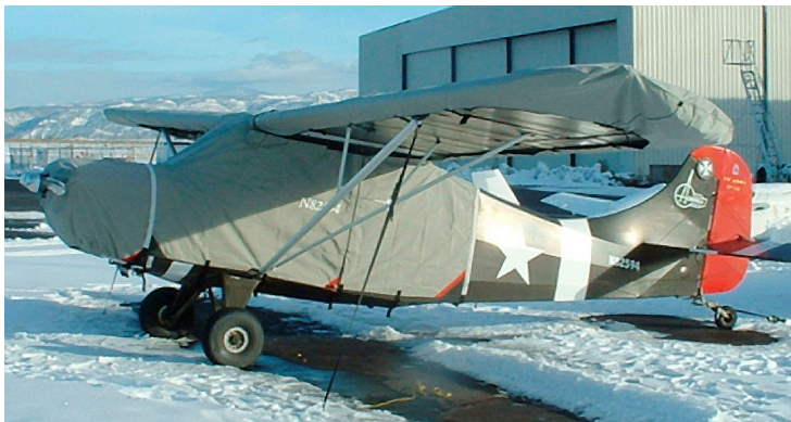
Extended Canopy Cover, Engine & Wing Covers

This cover type is made from Silver Acrylic Sunbrella canvas and is 100% lined with a soft and smooth microfiber. Bruce's Custom Covers developed this material combination especially for aircraft protection. The outer material is medium weight and treated for water resistance, UV resistance and anti-static buildup. The inner lining is a very soft and smooth microfiber to prevent scratching. The material is very reflective, and tests show that the cabin interior temperature can be reduced to near-ambient temperature on the hottest of days. It is water, ice and snow repellent, yet breathable to allow moisture to escape from between the cover and the aircraft surface.