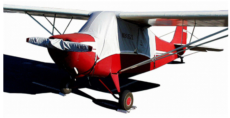
Aeronca Champ Canopy & Prop Covers