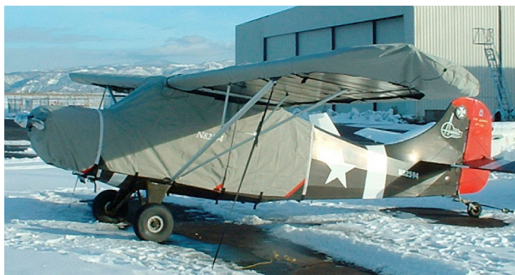
Extended Canopy Cover, Engine & Wing Covers