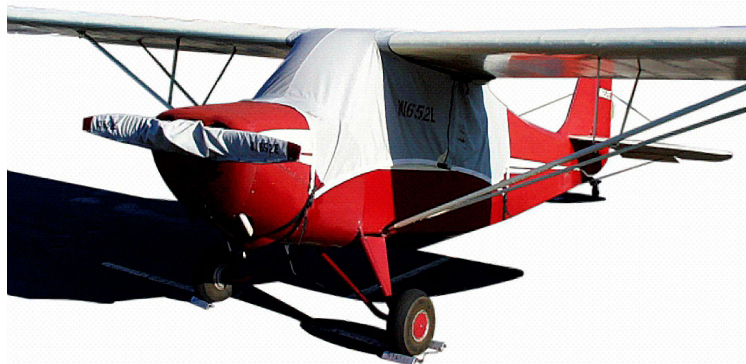
Aeronca Champ Canopy & Prop Covers

This cover type is made from Silver Acrylic Sunbrella canvas and is 100% lined with a soft and smooth microfiber. Bruce's Custom Covers developed this material combination especially for aircraft protection. The outer material is medium weight and treated for water resistance, UV resistance and anti-static buildup. The inner lining is a very soft and smooth microfiber to prevent scratching. The material is very reflective, and tests show that the cabin interior temperature can be reduced to near-ambient temperature on the hottest of days. It is water, ice and snow repellent, yet breathable to allow moisture to escape from between the cover and the aircraft surface.