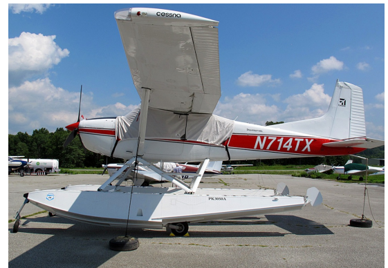
Cessna 185 Canopy Cover