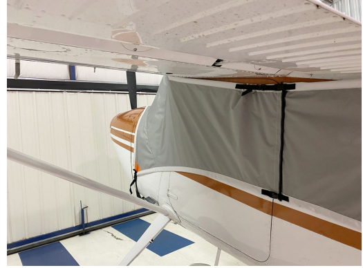
Cessna 180 Travel Weight Canopy Cover