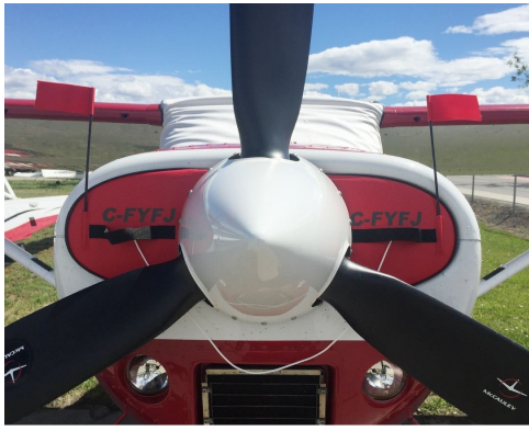
Cessna 185F Engine Plugs