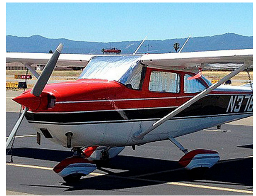
Cessna 172 Cabin HeatShields