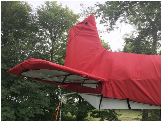
Cessna 185 Empennage Cover

WINTER USE MATERIAL - Made with Solution-Dyed Polyester fabric, this option is intended for seasonal use to aid in deicing, rain mitigation, or for occasional travel. The material is lighter and more compact, but more susceptible to UV damage and may have a shorter useful life if used continuously outside than the all-year use material.