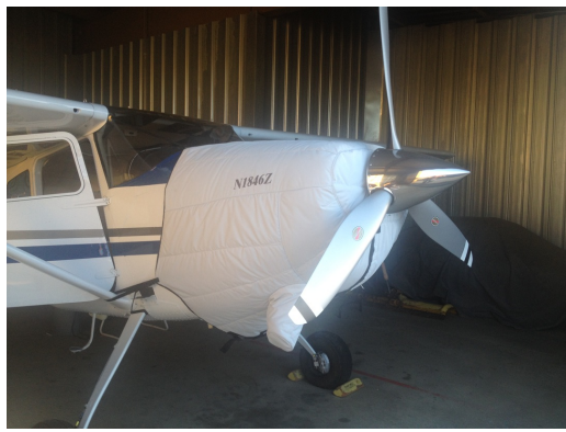
Cessna 180 Insulated Engine Cover