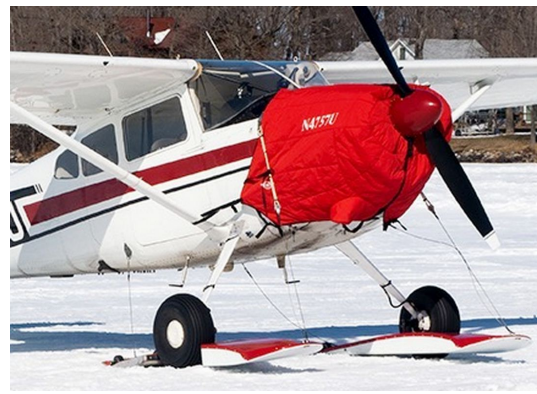
Cessna 180 Insulated Engine Cover