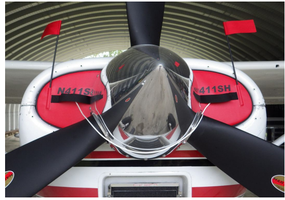
Cessna 180G Engine Inlet Plugs