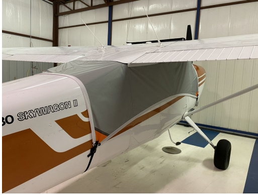
Cessna 180 Travel Weight Canopy Cover

The material is very reflective, and tests show that the cabin interior temperature can be reduced to near-ambient temperature on the hottest of days. It is water, ice and snow repellent, yet breathable to allow moisture to escape from between the cover and the aircraft surface.