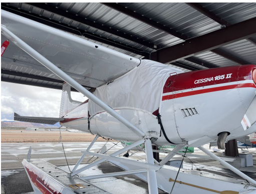
Cessna 185 Canopy Cover, Wrap-Around, Bubble Side Windows

This cover type is made from Silver Acrylic Sunbrella canvas and is 100% lined with a soft and smooth microfiber. Bruce's Custom Covers developed this material combination especially for aircraft protection. The outer material is medium weight and treated for water resistance, UV resistance and anti-static buildup. The inner lining is a very soft and smooth microfiber to prevent scratching. The material is very reflective, and tests show that the cabin interior temperature can be reduced to near-ambient temperature on the hottest of days. It is water, ice and snow repellent, yet breathable to allow moisture to escape from between the cover and the aircraft surface.