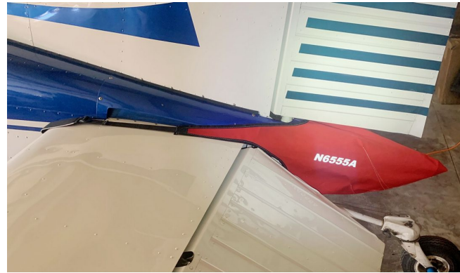
Cessna 180 Skywagon Tailcone Cover