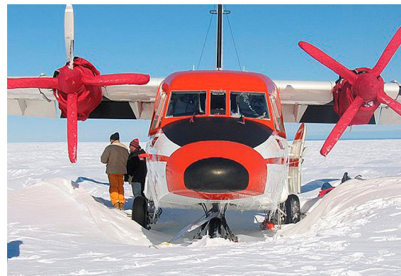
Casa 212 Insulated Engine & Propellor/Spinner Covers