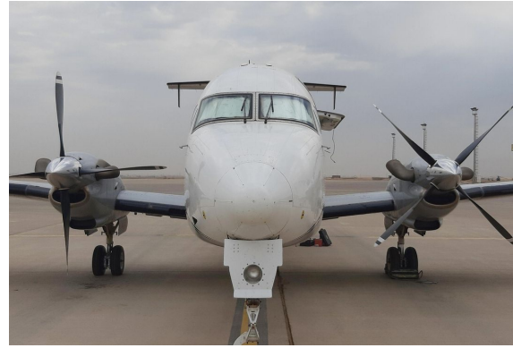
Raytheon 1900D Cockpit HeatShields