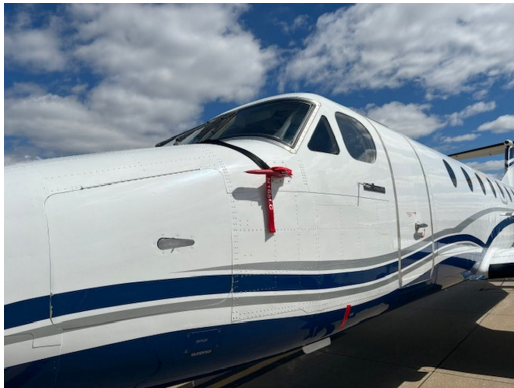
Beech 1900C PITOT COVERS

Engine Inlet Plugs are custom fit for your Beech 1900C intakes, made with heavy-duty vinyl material, and stuffed with a single block of sculpted urethane foam. Each plug has a zipper that allows the foam to be removed and dried if necessary. Engine plugs have warning flags that are visible from the cockpit or 'remove before flight' streamers sewn onto the face of the plugs. Most plugs are imprinted with the aircraft registration number in black for an extra charge. Storage bag NOT included. Engine plugs may be inserted after flight when the engine is still warm. Engine Inlet Plugs are commonly referred to as Cowl Plugs, Intake Plugs, Cowl Blocks, Engine Blocks, and Engine Bunges.