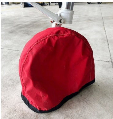
Beech King Air 300 Tire Covers (nose gear)

ALL-YEAR USE MATERIAL - Made with Silver Acrylic Sunbrella canvas, the all-year use material is the best option for sun protection and cover longevity. This heavier more durable material is intended for all weather conditions, such as rain and snow or lots of sun.