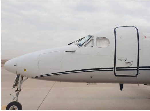
Raytheon 1900D Cockpit HeatShields

Cockpit Heatshields are interior sunshades for the aircraft's cockpit. The product is a unique composite of closed-cell foam with a silver mylar finish. The semi-rigid design is stiff enough to stand inside the window framing. The set folds up flat and is easily stored in the included storage sleeve. Some designs may require velcro and suction cups. A Heatshield is an excellent short-term remedy for cockpit overheating, but an external fabric cover is more effective for long-term protection.