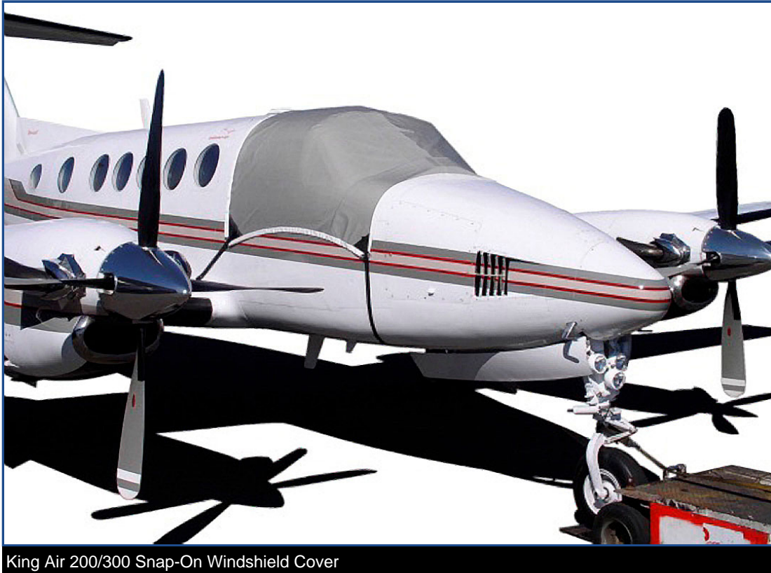
King Air 200/300 Snap-On Windshield Cover