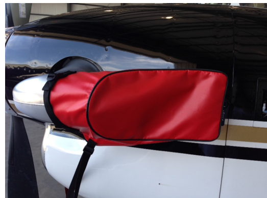
King Air Exhaust Stack Cover