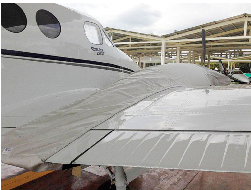
King Air C90 Engine Cover

This cover type is made from Silver Acrylic Sunbrella canvas and is 100% lined with a soft and smooth microfiber. Bruce's Custom Covers developed this material combination especially for aircraft protection. The outer material is medium weight and treated for water resistance, UV resistance and anti-static buildup. The inner lining is a very soft and smooth microfiber to prevent scratching. The material is very reflective, and tests show that the cabin interior temperature can be reduced to near-ambient temperature on the hottest of days. It is water, ice and snow repellent, yet breathable to allow moisture to escape from between the cover and the aircraft surface.