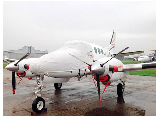
King Air Cockpit/Nose Cover, Plugs, Prop Tie/Exhaust Covers