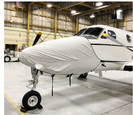
King Air 200 Nose Cover