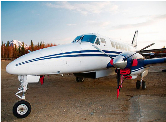
Beech 99 Engine Plugs & Prop Ties

Engine Inlet Plugs are custom fit for your Beech 1900D intakes, made with heavy-duty vinyl material, and stuffed with a single block of sculpted urethane foam. Each plug has a zipper that allows the foam to be removed and dried if necessary. Engine plugs have warning flags that are visible from the cockpit or 'remove before flight' streamers sewn onto the face of the plugs. Most plugs are imprinted with the aircraft registration number in black for an extra charge. Storage bag NOT included. Engine plugs may be inserted after flight when the engine is still warm. Engine Inlet Plugs are commonly referred to as Cowl Plugs, Intake Plugs, Cowl Blocks, Engine Blocks, and Engine Bungs.