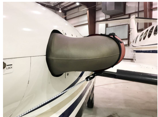
Beech King Air 350 Exhaust Covers