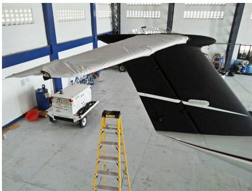
Beech King Air B350 Horizontal Stabilizer Covers

WINTER USE MATERIAL - Made with Solution-Dyed Polyester fabric, this option is intended for seasonal use to aid in deicing, rain mitigation, or for occasional travel. The material is lighter and more compact, but more susceptible to UV damage and may have a shorter useful life if used continuously outside than the all-year use material.