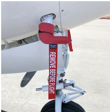
Beech King Air Pitot Covers

Engine Inlet Plugs are custom fit for your Beech 1900D intakes, made with heavy-duty vinyl material, and stuffed with a single block of sculpted urethane foam. Each plug has a zipper that allows the foam to be removed and dried if necessary. Engine plugs have warning flags that are visible from the cockpit or 'remove before flight' streamers sewn onto the face of the plugs. Most plugs are imprinted with the aircraft registration number in black for an extra charge. Storage bag NOT included. Engine plugs may be inserted after flight when the engine is still warm. Engine Inlet Plugs are commonly referred to as Cowl Plugs, Intake Plugs, Cowl Blocks, Engine Blocks, and Engine Bungs.