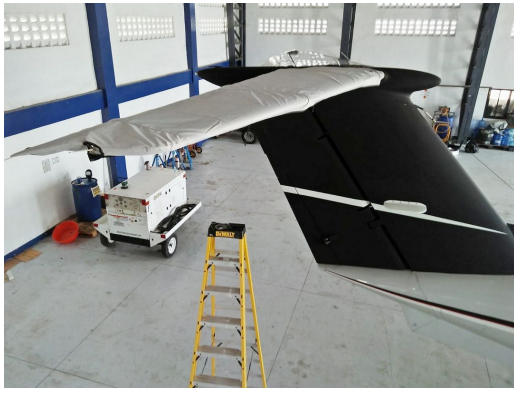
Beech King Air B350 Horizontal Stabilizer Covers