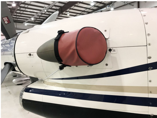
Beech King Air 350 Exhaust Covers

This cover type is made from Silver Acrylic Sunbrella canvas and is 100% lined with a soft and smooth microfiber. Bruce's Custom Covers developed this material combination especially for aircraft protection. The outer material is medium weight and treated for water resistance, UV resistance and anti-static buildup. The inner lining is a very soft and smooth microfiber to prevent scratching. The material is very reflective, and tests show that the cabin interior temperature can be reduced to near-ambient temperature on the hottest of days. It is water, ice and snow repellent, yet breathable to allow moisture to escape from between the cover and the aircraft surface.