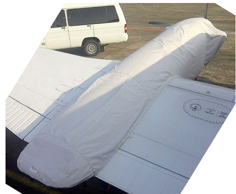
King Air 350 Engine Cover