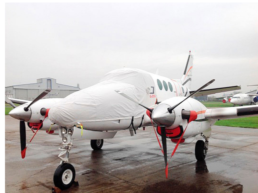
King Air Cockpit/Nose Cover, Plugs, Prop Tie/Exhaust Covers