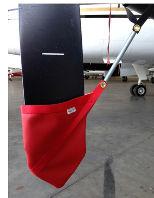
King Air Prop Tie