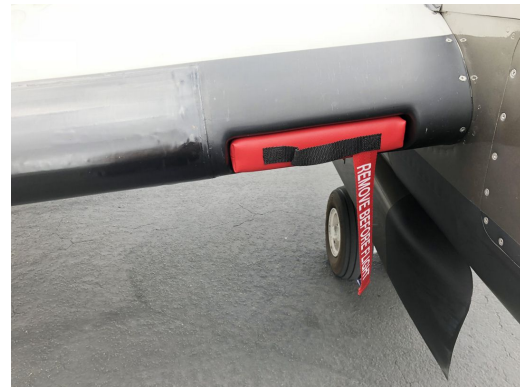
Beech King Air Heat Exchanger Inlet Plug