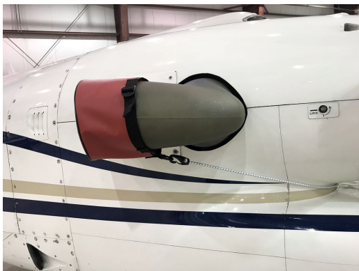
Beech King Air 350 Exhaust Covers

This cover type is made from Silver Acrylic Sunbrella canvas and is 100% lined with a soft and smooth microfiber. Bruce's Custom Covers developed this material combination especially for aircraft protection. The outer material is medium weight and treated for water resistance, UV resistance and anti-static buildup. The inner lining is a very soft and smooth microfiber to prevent scratching. The material is very reflective, and tests show that the cabin interior temperature can be reduced to near-ambient temperature on the hottest of days. It is water, ice and snow repellent, yet breathable to allow moisture to escape from between the cover and the aircraft surface.