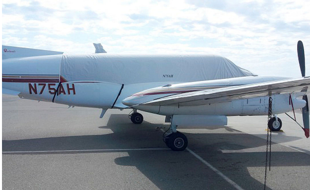
King Air 350 Canopy Cover

The Beech 1900D Nose Cover is designed to cover the section of the fuselage forward of the windshield to the tip of the nose. It is secured with belly straps. This cover type is made from Silver Acrylic Sunbrella canvas and is 100% lined with a soft and smooth microfiber. Bruce's Custom Covers developed this material combination especially for aircraft protection. The outer material is medium weight and treated for water resistance, UV resistance and anti-static buildup. The inner lining is a very soft and smooth microfiber to prevent scratching. The material is very reflective, and tests show that the cabin interior temperature can be reduced to near-ambient temperature on the hottest of days. It is water, ice and snow repellent, yet breathable to allow moisture to escape from between the cover and the aircraft surface.