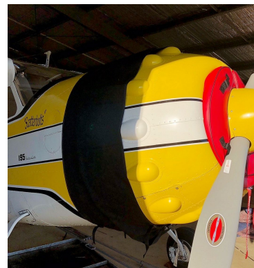
Cessna 195 Engine Plugs, Cowl Ring Gap Cover