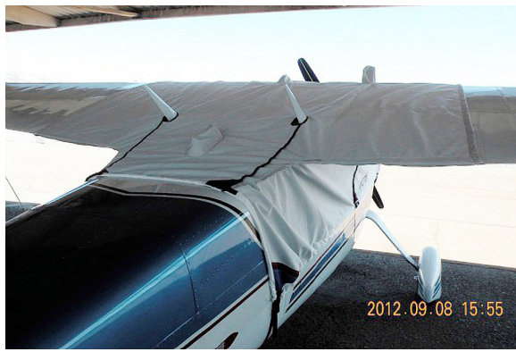
Cessna 195 Over-Top Canopy Cover with underbelly gap seal, & Engine Inlet Plugs