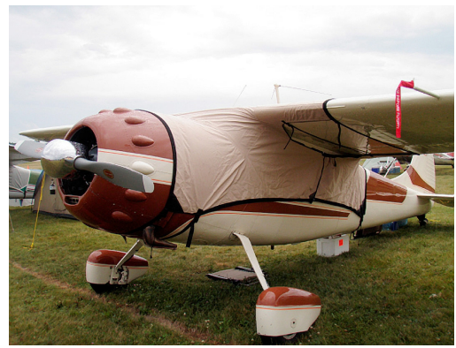
Cessna 195 Canopy Cover, extended forward and over gas caps