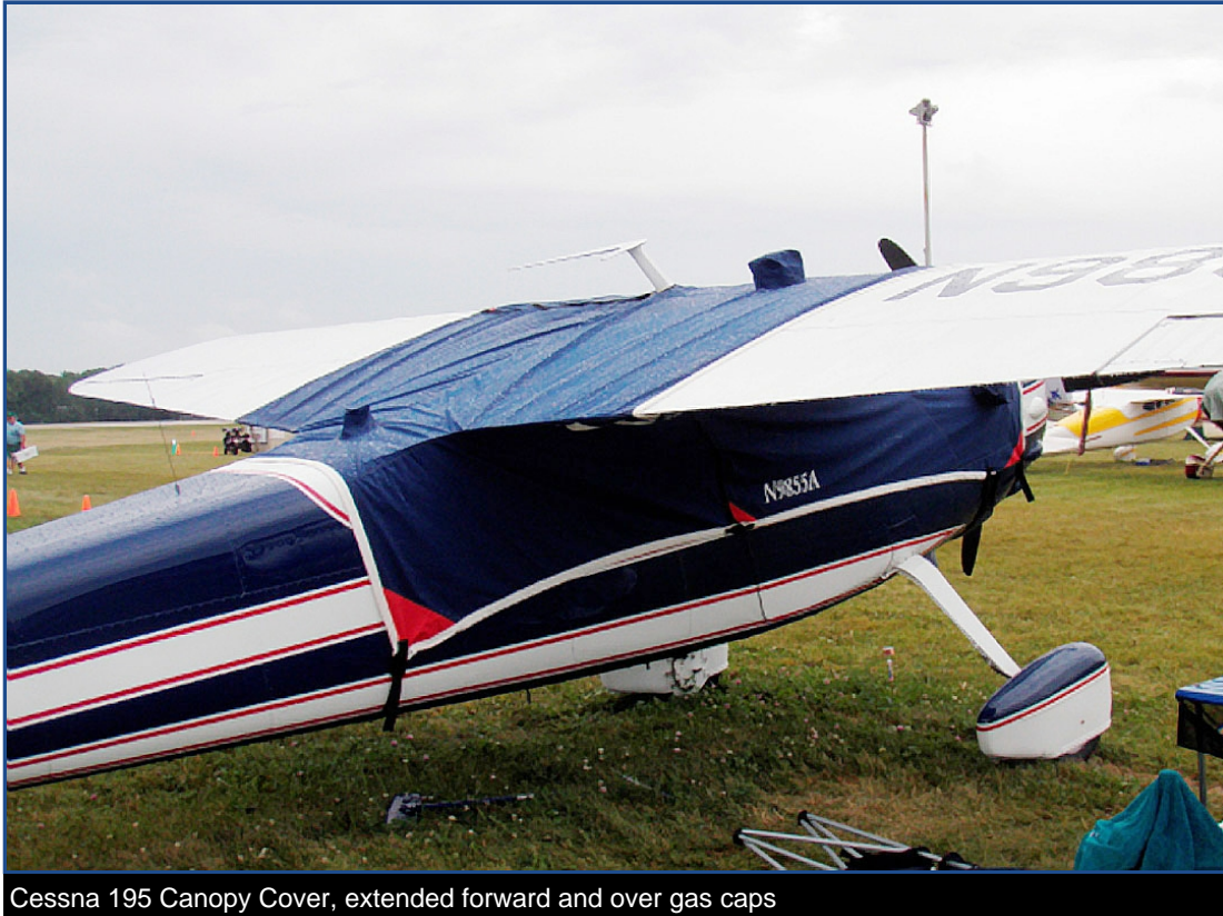
Cessna 195 Canopy Cover, extended forward and over gas caps