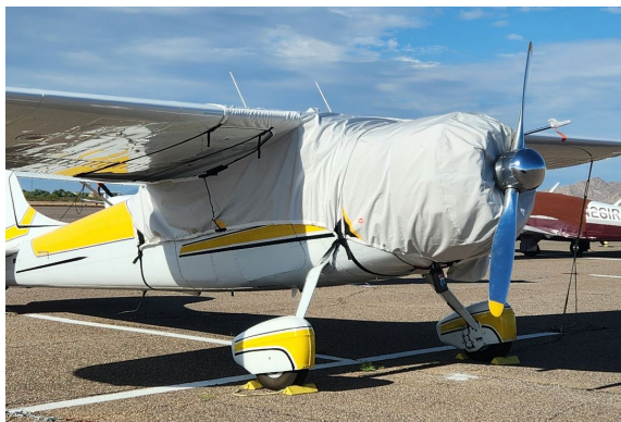
Cessna 190 & 195 Canopy Cover, Over-Top, 12" Fwd Ext, Gas Cap Ext., & Engine Cover

This cover type is made from Silver Acrylic Sunbrella canvas and is 100% lined with a soft and smooth microfiber. Bruce's Custom Covers developed this material combination especially for aircraft protection. The outer material is medium weight and treated for water resistance, UV resistance and anti-static buildup. The inner lining is a very soft and smooth microfiber to prevent scratching. The material is very reflective, and tests show that the cabin interior temperature can be reduced to near-ambient temperature on the hottest of days. It is water, ice and snow repellent, yet breathable to allow moisture to escape from between the cover and the aircraft surface.