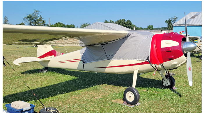
Cessna 190 Travel Cover, Light Weight Canopy Cover, Over-Top Type