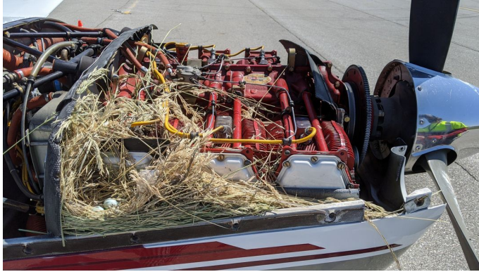
ENGINE PLUGS PREVENT BIRD NEST FOD. Piper Saratoga Engine Cowling Bird's Nest

Engine Inlet Plugs are custom fit for your Cessna 190 & 195 intakes, made with heavy-duty vinyl material, and stuffed with a single block of sculpted urethane foam. Each plug has a zipper that allows the foam to be removed and dried if necessary. Engine plugs have warning flags that are visible from the cockpit or 'remove before flight' streamers sewn onto the face of the plugs. Most plugs are imprinted with the aircraft registration number in black for an extra charge. Storage bag NOT included. Engine plugs may be inserted after flight when the engine is still warm. Engine Inlet Plugs are commonly referred to as Cowl Plugs, Intake Plugs, Cowl Blocks, Engine Blocks, and Engine Bungs.