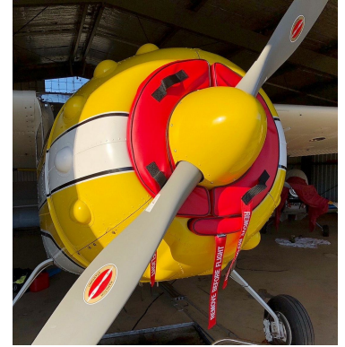
Cessna 195 Engine Plugs