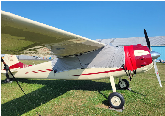
Cessna 190 Travel Cover, Light Weight Canopy Cover, Over-Top Type

This cover type is made from Silver Acrylic Sunbrella canvas and is 100% lined with a soft and smooth microfiber. Bruce's Custom Covers developed this material combination especially for aircraft protection. The outer material is medium weight and treated for water resistance, UV resistance and anti-static buildup. The inner lining is a very soft and smooth microfiber to prevent scratching. The material is very reflective, and tests show that the cabin interior temperature can be reduced to near-ambient temperature on the hottest of days. It is water, ice and snow repellent, yet breathable to allow moisture to escape from between the cover and the aircraft surface.