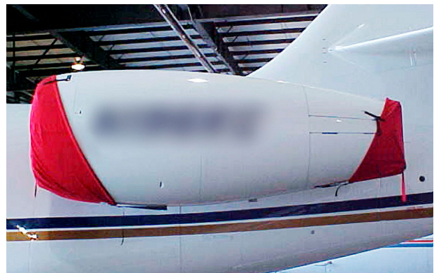
Falcon 2000 Intake/Exhaust Cover Set