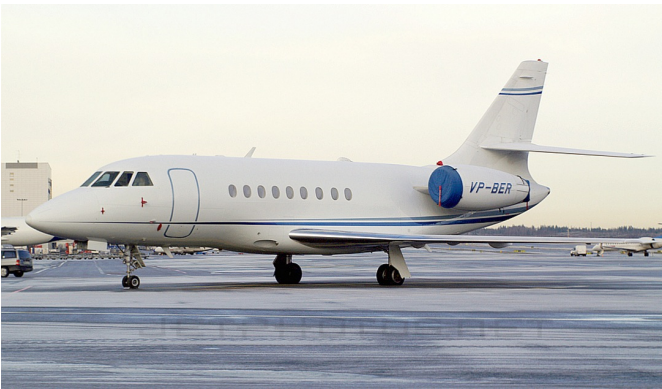
Falcon 2000 Engine Cover Set