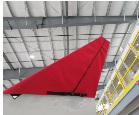
Bombardier Global Express Padded Winglet Covers