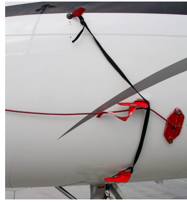
Falcon Jet 2000 Pitot Covers, Aoa's, Tat Cover Set, Heat Resistant Type