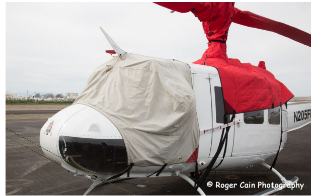
Bell 205 Engine, Rotor Mast, Blades & Forward Cabin Covers