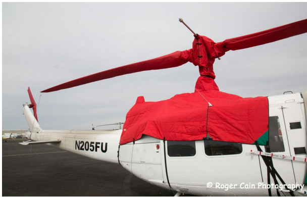
Bell 205 Engine, Rotor Mast & Blades Covers

WINTER USE MATERIAL - Made with Solution-Dyed Polyester fabric, this option is intended for seasonal use to aid in deicing, rain mitigation, or for occasional travel. The material is lighter and more compact, but more susceptible to UV damage and may have a shorter useful life if used continuously outside than the all-year use material.