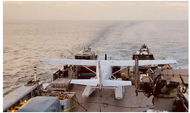
Cessna 182 Insulated Engine Cover ext. to l.e of nose gear, Extended Canopy Cover