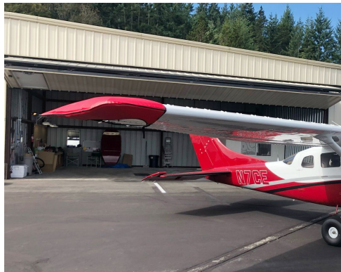
Cessna 206 Wingtip Pads

Designed to prevent damage to the aircraft extremities in crowded hangars, these products are made of bright red Naugahyde and thickly padded with a sandwich of closed cell foam.