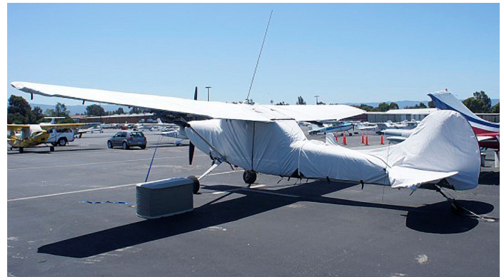
Wing Covers on Cessna Bird Dog