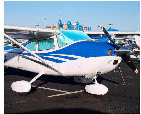
Cessna 182 HeatShield Set