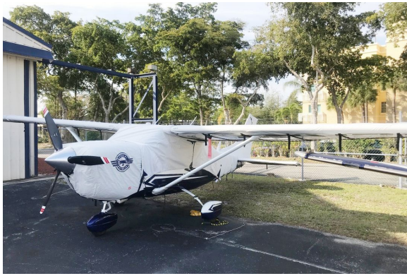
Cessna T206H Canopy, Engine, Wing & Empennage Covers