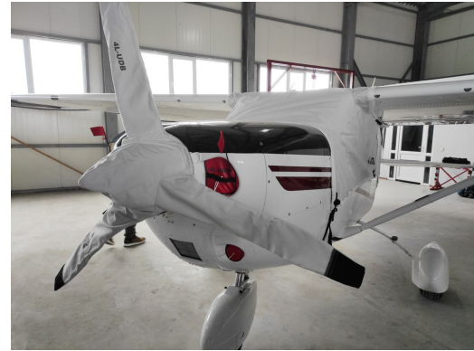
Cessna 206 3-Blade Prop Cover, Engine Plugs