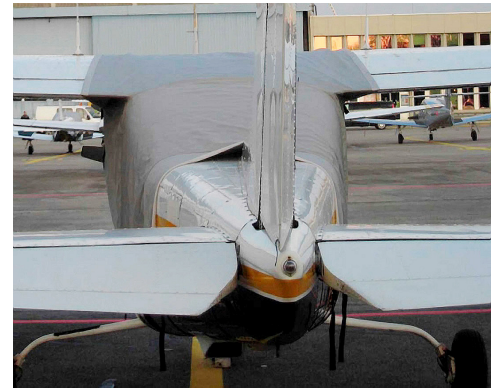
Cessna 210 Over-the-Top Canopy Cover