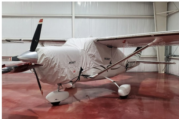
Textron Aviation Inc T206H Canopy cover over the top