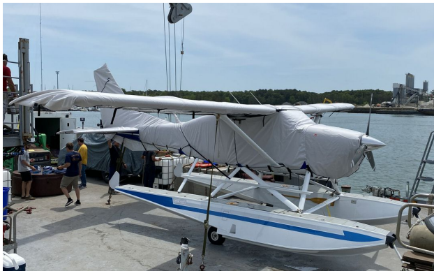
Cessna U206F Amphib Cover Set

WINTER USE MATERIAL - Made with Solution-Dyed Polyester fabric, this option is intended for seasonal use to aid in deicing, rain mitigation, or for occasional travel. The material is lighter and more compact, but more susceptible to UV damage and may have a shorter useful life if used continuously outside than the all-year use material.