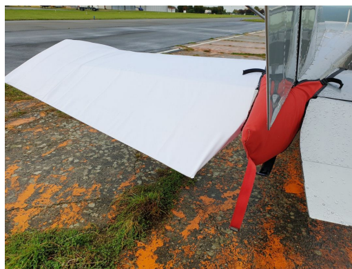
Cessna 207 Tailcone Cover, Horizontal Stab. Cover (test fit)