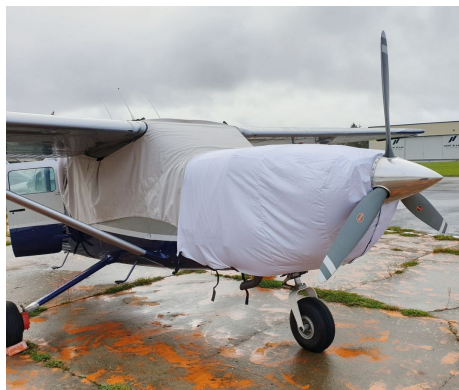
Cessna 207 Engine Cover (test fit)