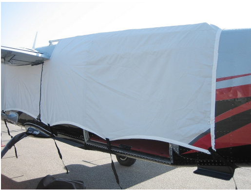
Cessna Caravan Canopy Cover