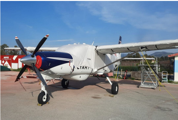
Cessna 208 Caravan Insulated Engine, Cockpit & Wing Covers Cessna 208 Caravan Wrap-Around Canopy Cover, Wing Covers