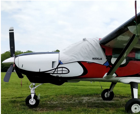
Cessna Caravan 208A Cockpit Cover