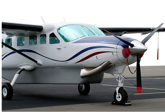
Cessna Caravan Windshield HeatShield, Plugs, Prop Ties & Pitot Cover