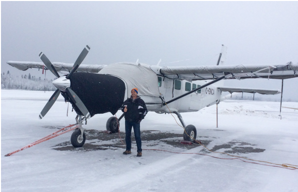
Cessna 208 Caravan Insulated Engine, Cockpit & Wing Covers

This cover type is made from Silver Acrylic Sunbrella canvas and is 100% lined with a soft and smooth microfiber. Bruce's Custom Covers developed this material combination especially for aircraft protection. The outer material is medium weight and treated for water resistance, UV resistance and anti-static buildup. The inner lining is a very soft and smooth microfiber to prevent scratching. The material is very reflective, and tests show that the cabin interior temperature can be reduced to near-ambient temperature on the hottest of days. It is water, ice and snow repellent, yet breathable to allow moisture to escape from between the cover and the aircraft surface.