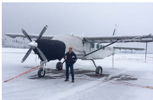
Cessna 208 Caravan Insulated Engine, Cockpit & Wing Covers Cessna 208 Caravan Insulated Engine, Cockpit & Wing Covers