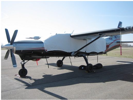
Cessna Caravan Canopy Cover

The material is very reflective, and tests show that the cabin interior temperature can be reduced to near-ambient temperature on the hottest of days. It is water, ice and snow repellent, yet breathable to allow moisture to escape from between the cover and the aircraft surface.