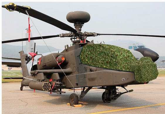
Canopy/Nose Cover, covers canopy glass and TADS

Canopy/Nose Covers enclose the entire canopy including the windshield, skylights, and chin bubble. Attachment buckles are made of nonmetal Delrin , designed for rugged outdoor use. Both the top and bottom hems of the cover have a special rope-hem feature with which they can be tightened to help prevent abrasive chafing of the windshield. Pockets are sewn into the cover for the temperature probe and pitot tubes. The bubble cover is reinforced with patches at hinge points, door handles, and for the windshield wipers. For ease of installation, the bubble cover is color-coded (red=left, green=right) with color swatches sewn into the corners. This cover type is made from Silver Acrylic Sunbrella canvas and is 100% lined with a soft and smooth microfiber. Bruce's Custom Covers developed this material combination especially for aircraft protection. The outer material is medium weight and treated for water resistance, UV resistance and anti-static buildup. The inner lining is a very soft and smooth microfiber to prevent scratching. The material is very reflective, and tests show that the cabin interior temperature can be reduced to near-ambient temperature on the hottest of days. It is water, ice and snow repellent, yet breathable to allow moisture to escape from between the cover and the aircraft surface.