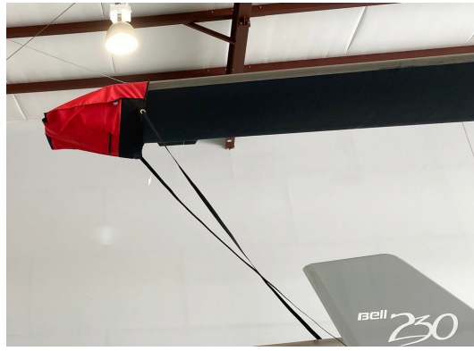
Bell 230 Blade Tie-Downs, (Semi-Rigid) W/Telescoping Attachment Handle