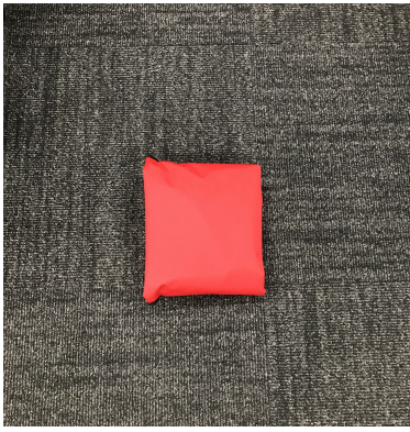
Folds down small.