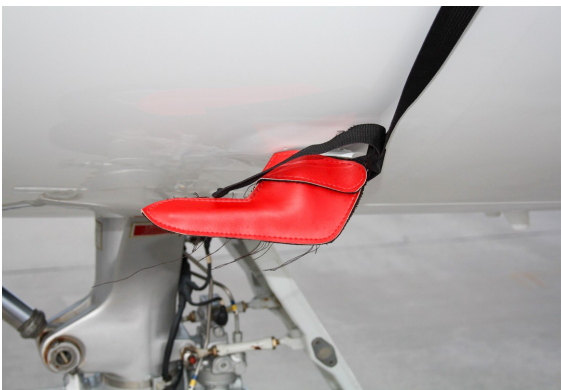
Falcon Jet 2000EX, 2000LXS Pitot Covers, Aoa's, Tat Cover Set, Heat Resistant Type