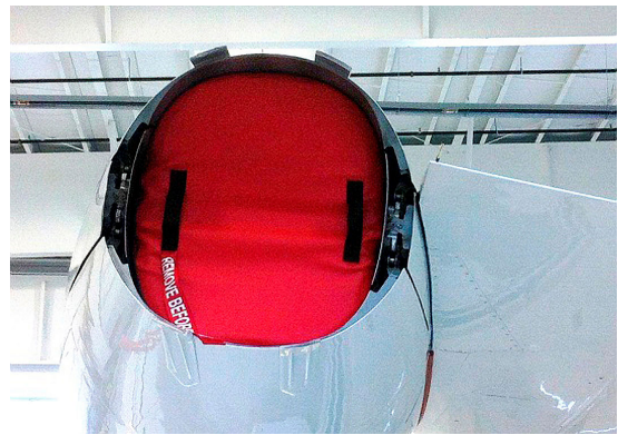
Falcon 2000EX Exhaust Plug