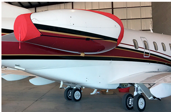
Intake/Exhaust Covers, 3-Strap Type. Successfully installed by two crew, one ladder.

The Falcon Jet 2000EX, 2000LXS Intake Covers are designed to install easily yet be completely storable. A spring steel hoop is sewn into the hem of each cover, allowing them to be installed without climbing onto the wing or using a stepladder. To store the covers the spring steel hoop folds like a band-saw blade into three nesting rings. Each cover folds into a compact circular bundle which is stored in the included duffel bag, yet they unfold quickly for use. The Tri-Fold Ring cover is made of medium weight nylon which is available in a variety of colors to match the paint trim. Each cover set comes complete with installation and folding instructions. The aircraft's registration number can be silkscreened onto the cover for an extra charge.