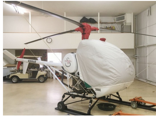
Schweizer 269C Bubble cover