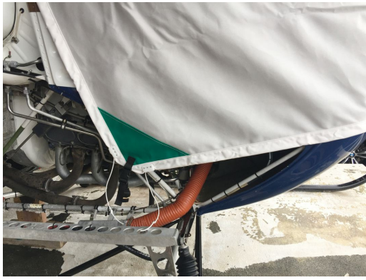
Hughes/Schweizer 300C Bubble Cover