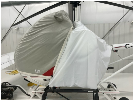
Schweizer 300C Engine Cover, test fit cover

WINTER USE MATERIAL - Made with Solution-Dyed Polyester fabric, this option is intended for seasonal use to aid in deicing, rain mitigation, or for occasional travel. The material is lighter and more compact, but more susceptible to UV damage and may have a shorter useful life if used continuously outside than the all-year use material.