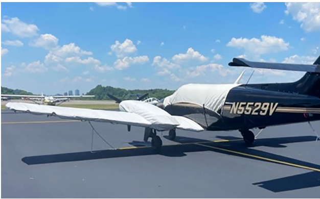
Cessna T303 Crusader Canopy Cover

This cover type is made from Silver Acrylic Sunbrella canvas and is 100% lined with a soft and smooth microfiber. Bruce's Custom Covers developed this material combination especially for aircraft protection. The outer material is medium weight and treated for water resistance, UV resistance and anti-static buildup. The inner lining is a very soft and smooth microfiber to prevent scratching. The material is very reflective, and tests show that the cabin interior temperature can be reduced to near-ambient temperature on the hottest of days. It is water, ice and snow repellent, yet breathable to allow moisture to escape from between the cover and the aircraft surface.