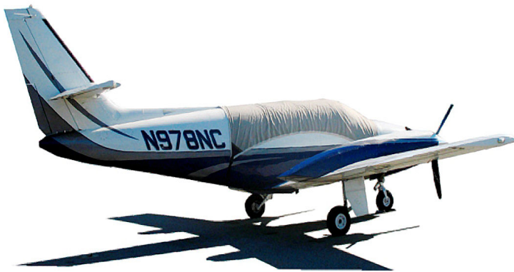
Cessna 303 Crusader Canopy Cover

Travel Covers are made with Silver Solution-Dyed Polyester fabric and only lined over the windshield to save weight. The material is lightweight and more compact for easy stowage in the aircraft. The polyester material is water resistant, but only intended for occasional use outside. We also have an ultra lightweight material available for fitted hangar dust covers. For daily outdoor use, the non-travel Sunbrella Cover is the best choice.