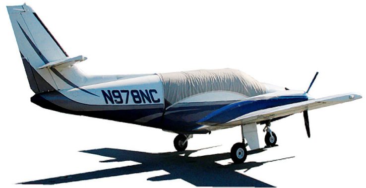
Cessna 303 Crusader Canopy Cover