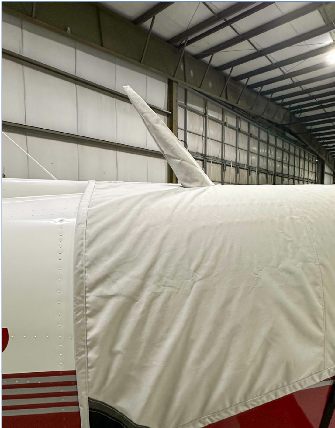
Cessna T303 Canopy Cover