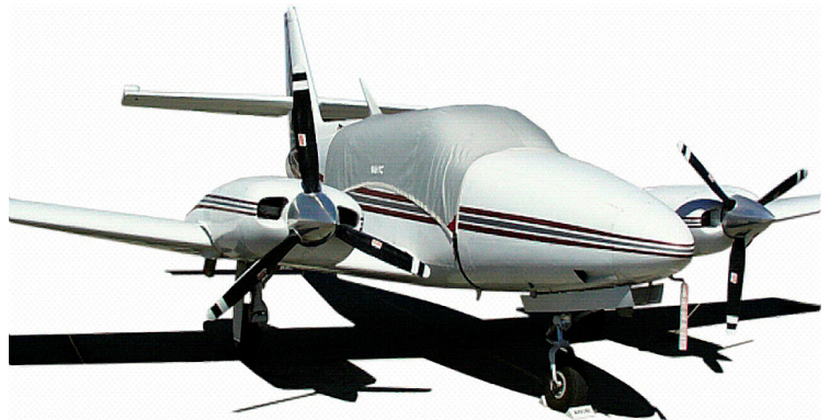
Cessna Crusader Standard Canopy Cover