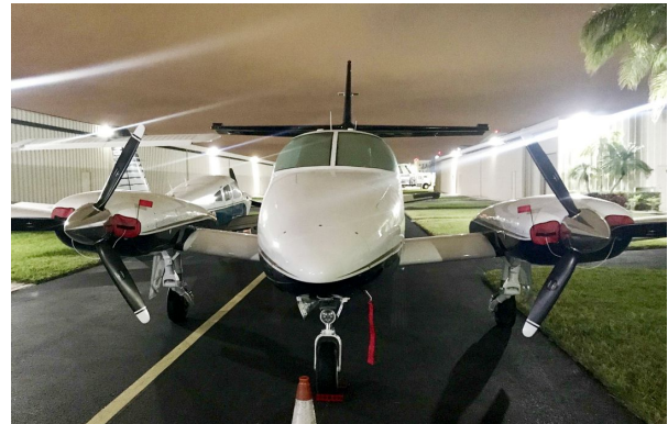
Cessna T303 Crusader Engine Inlet Plugs