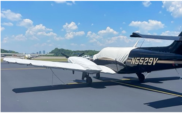
Cessna T303 Crusader Canopy Cover