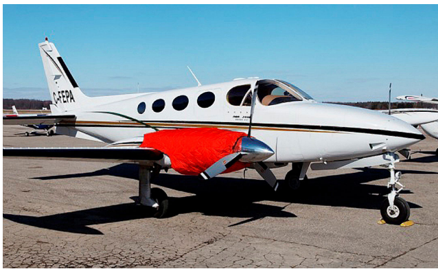
Cessna 340 Insulated Engine Covers

This cover type is made from Silver Acrylic Sunbrella canvas and is 100% lined with a soft and smooth microfiber. Bruce's Custom Covers developed this material combination especially for aircraft protection. The outer material is medium weight and treated for water resistance, UV resistance and anti-static buildup. The inner lining is a very soft and smooth microfiber to prevent scratching. The material is very reflective, and tests show that the cabin interior temperature can be reduced to near-ambient temperature on the hottest of days. It is water, ice and snow repellent, yet breathable to allow moisture to escape from between the cover and the aircraft surface.