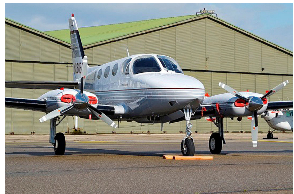
Cessna 340 Engine Plugs