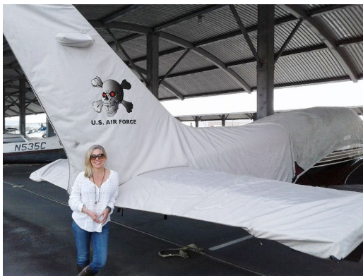
Cessna 310R Empennage Cover