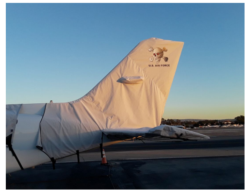
Cessna 421 Empennage Cover