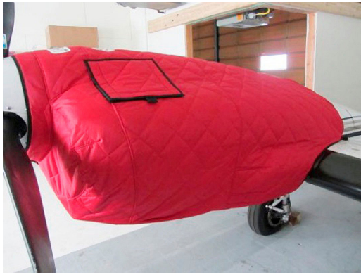
Cessna 421 Insulated Engine Covers