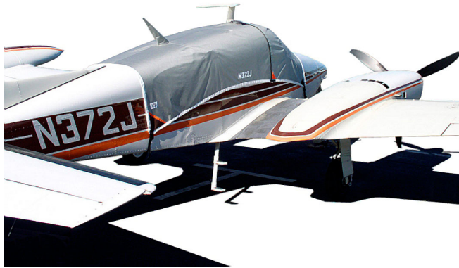
Cessna 320 Canopy Cover

Travel Covers are made with Silver Solution-Dyed Polyester fabric and only lined over the windshield to save weight. The material is lightweight and more compact for easy stowage in the aircraft. The polyester material is water resistant, but only intended for occasional use outside. We also have an ultra lightweight material available for fitted hangar dust covers. For daily outdoor use, the non-travel Sunbrella Cover is the best choice.