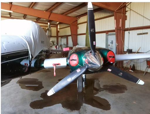
Cessna 310 Engine and Center Section Plugs

Engine Inlet Plugs are custom fit for your Cessna 320 intakes, made with heavy-duty vinyl material, and stuffed with a single block of sculpted urethane foam. Each plug has a zipper that allows the foam to be removed and dried if necessary. Engine plugs have warning flags that are visible from the cockpit or 'remove before flight' streamers sewn onto the face of the plugs. Most plugs are imprinted with the aircraft registration number in black for an extra charge. Storage bag NOT included. Engine plugs may be inserted after flight when the engine is still warm. Engine Inlet Plugs are commonly referred to as Cowl Plugs, Intake Plugs, Cowl Blocks, Engine Blocks, and Engine Bungs.