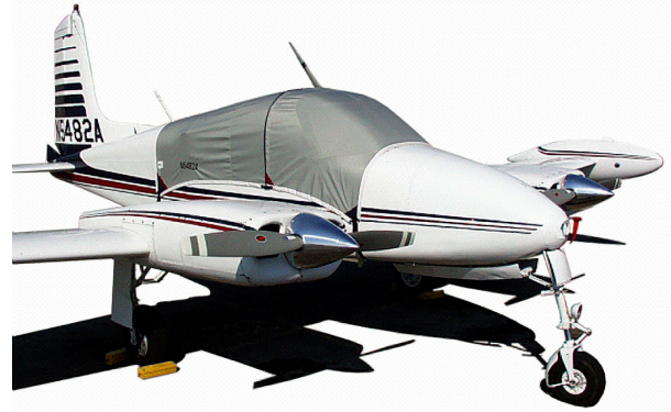
Cessna 310A Canopy Cover