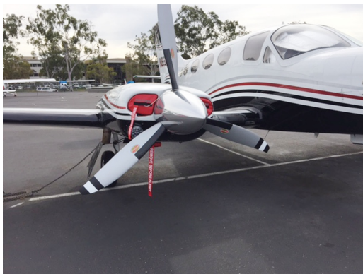
Cessna 414 Engine Inlet Plugs

Engine Inlet Plugs are custom fit for your Cessna 320 intakes, made with heavy-duty vinyl material, and stuffed with a single block of sculpted urethane foam. Each plug has a zipper that allows the foam to be removed and dried if necessary. Engine plugs have warning flags that are visible from the cockpit or 'remove before flight' streamers sewn onto the face of the plugs. Most plugs are imprinted with the aircraft registration number in black for an extra charge. Storage bag NOT included. Engine plugs may be inserted after flight when the engine is still warm. Engine Inlet Plugs are commonly referred to as Cowl Plugs, Intake Plugs, Cowl Blocks, Engine Blocks, and Engine Bungs.