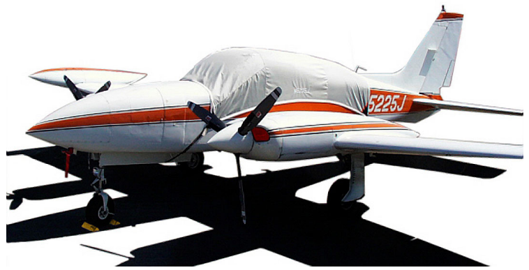
Cessna 310Q Canopy Cover