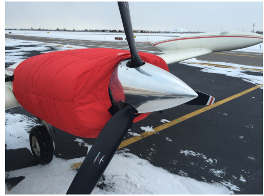
Cessna 310 Insulated Engine Cover