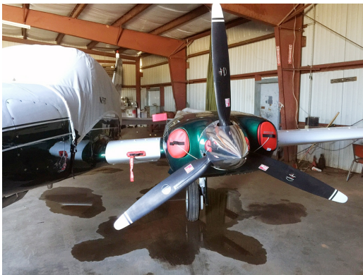
Cessna 310 Engine and Center Section Plugs

Engine Inlet Plugs are custom fit for your Cessna 320 intakes, made with heavy-duty vinyl material, and stuffed with a single block of sculpted urethane foam. Each plug has a zipper that allows the foam to be removed and dried if necessary. Engine plugs have warning flags that are visible from the cockpit or 'remove before flight' streamers sewn onto the face of the plugs. Most plugs are imprinted with the aircraft registration number in black for an extra charge. Storage bag NOT included. Engine plugs may be inserted after flight when the engine is still warm. Engine Inlet Plugs are commonly referred to as Cowl Plugs, Intake Plugs, Cowl Blocks, Engine Blocks, and Engine Bungs.