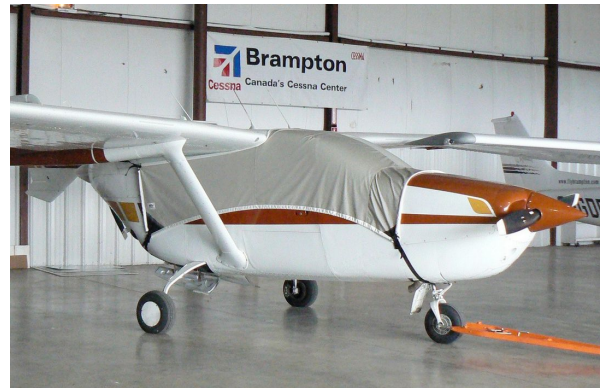
Cessna 337 Skymaster Canopy Cover w/15" Bib