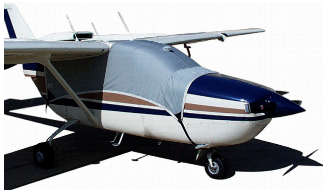
Cessna Skymaster Canopy Cover with Forward Extension