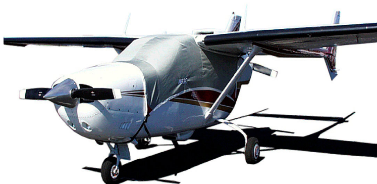
Cessna Skymaster Canopy Cover w/ 14" bib ext.

This cover type is made from Silver Acrylic Sunbrella canvas and is 100% lined with a soft and smooth microfiber. Bruce's Custom Covers developed this material combination especially for aircraft protection. The outer material is medium weight and treated for water resistance, UV resistance and anti-static buildup. The inner lining is a very soft and smooth microfiber to prevent scratching. The material is very reflective, and tests show that the cabin interior temperature can be reduced to near-ambient temperature on the hottest of days. It is water, ice and snow repellent, yet breathable to allow moisture to escape from between the cover and the aircraft surface.