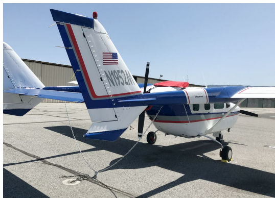
Cessna Skymaster 337G Rear Engine Inlet Cover

Engine Inlet Plugs are custom fit for your Cessna 336 (Fixed Gear Skymaster) intakes, made with heavy-duty vinyl material, and stuffed with a single block of sculpted urethane foam. Each plug has a zipper that allows the foam to be removed and dried if necessary. Engine plugs have warning flags that are visible from the cockpit or 'remove before flight' streamers sewn onto the face of the plugs. Most plugs are imprinted with the aircraft registration number in black for an extra charge. Storage bag NOT included. Engine plugs may be inserted after flight when the engine is still warm. Engine Inlet Plugs are commonly referred to as Cowl Plugs, Intake Plugs, Cowl Blocks, Engine Blocks, and Engine Bung.