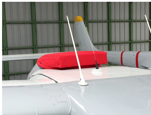
Cessna 337 Skymaster Aft Engine Inlet Cover, hoop type