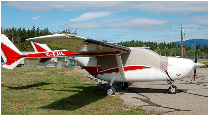
Cessna 337 Skymaster Canopy Cover w/ 14" bib ext.

This cover type is made from Silver Acrylic Sunbrella canvas and is 100% lined with a soft and smooth microfiber. Bruce's Custom Covers developed this material combination especially for aircraft protection. The outer material is medium weight and treated for water resistance, UV resistance and anti-static buildup. The inner lining is a very soft and smooth microfiber to prevent scratching. The material is very reflective, and tests show that the cabin interior temperature can be reduced to near-ambient temperature on the hottest of days. It is water, ice and snow repellent, yet breathable to allow moisture to escape from between the cover and the aircraft surface.