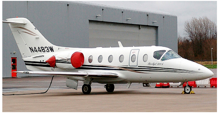
Beechjet 400 Engine Covers