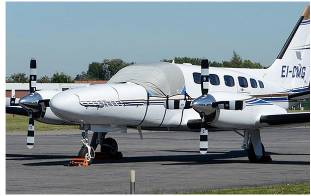
Cessna 441 Cockpit Cover