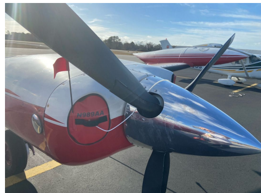
Cessna 401A Engine Inlet Plugs