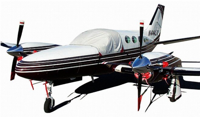
Cessna 425 Cockpit Cover