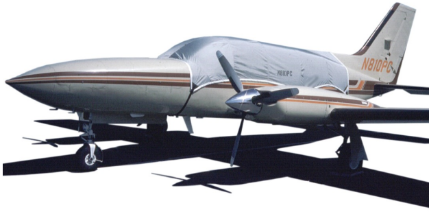
Cessna 421 Cockpit/Windshield Cover