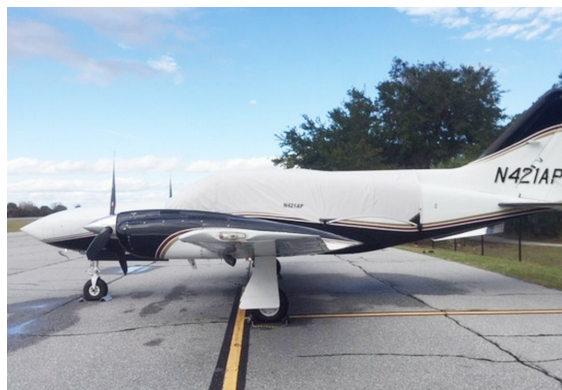
Cessna 421 Canopy Cover