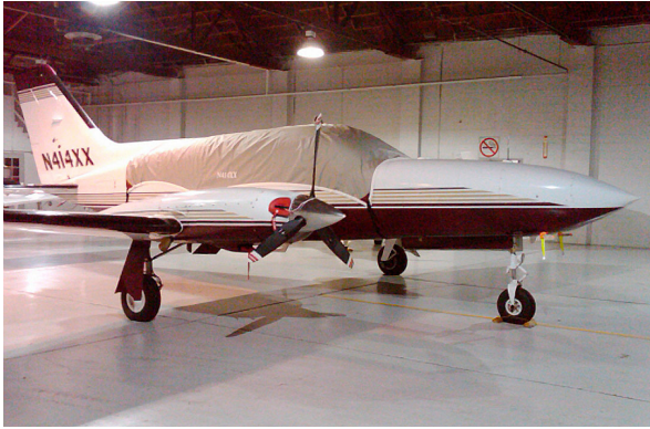
Cessna 414 Canopy Cover and Engine Inlet Plugs

non-travel Sunbrella Cover is the best choice.