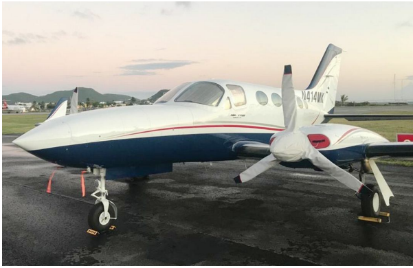
Cessna 414 Propellor/Spinner Covers, 3 Blade

window framing. It folds up flat and easily stores in the included storage sleeve. Some designs may require velcro and suction cups. A Heatshield is an excellent short-term remedy for cockpit overheating.