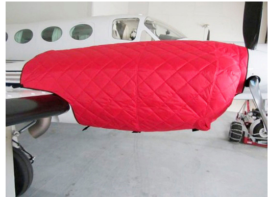
Cessna 421 Insulated Engine Covers