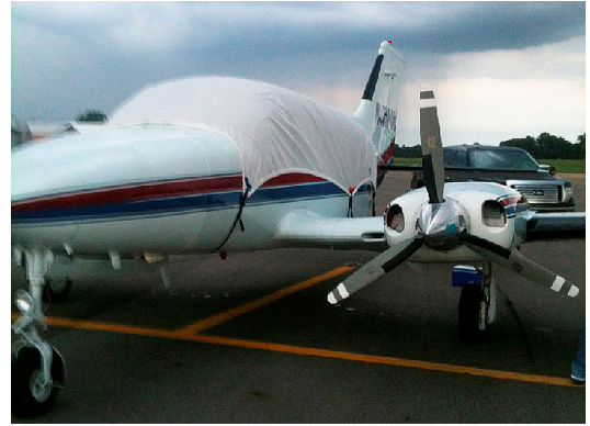
Cessna 401B Canopy Cover