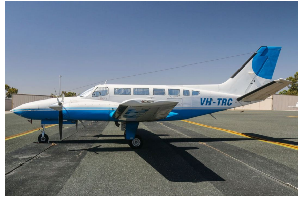
Cessna 404 & F406 HeatShields