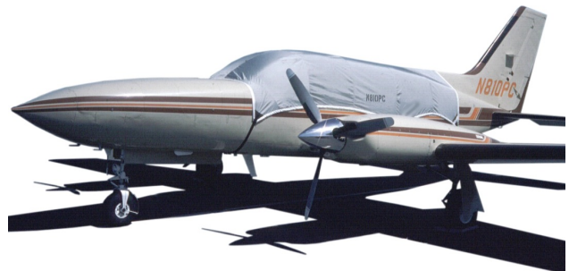
Cessna 421 Cockpit/Windshield Cover