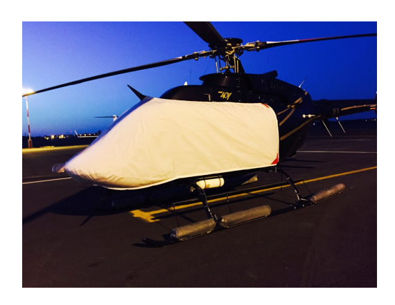
Bell 407 Bubble Cover with Wire Strike

This cover type is made from Silver Acrylic Sunbrella canvas and is 100% lined with a soft and smooth microfiber. Bruce's Custom Covers developed this material combination especially for aircraft protection. The outer material is medium weight and treated for water resistance, UV resistance and anti-static buildup. The inner lining is a very soft and smooth microfiber to prevent scratching. The material is very reflective, and tests show that the cabin interior temperature can be reduced to near-ambient temperature on the hottest of days. It is water, ice and snow repellent, yet breathable to allow moisture to escape from between the cover and the aircraft surface.