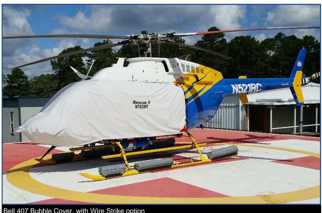
Bell 407 Bubble Cover, with Wire Strike option