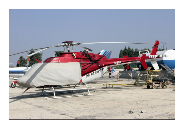
Bell 407 Bubble Cover with Wire Strike