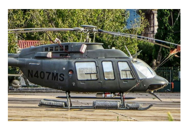
Bell 407 Cockpit & Cabin HeatShields