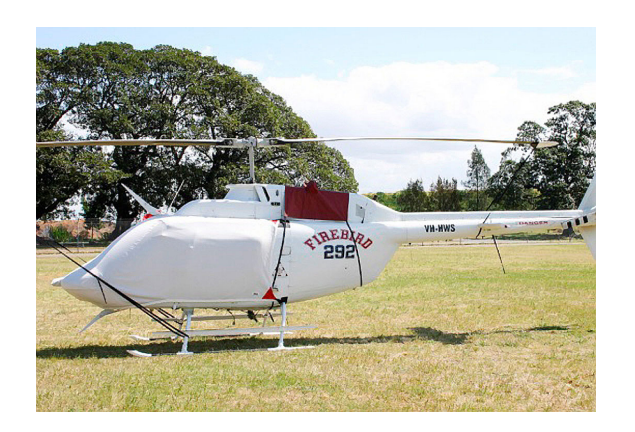
206B Bubble Cover