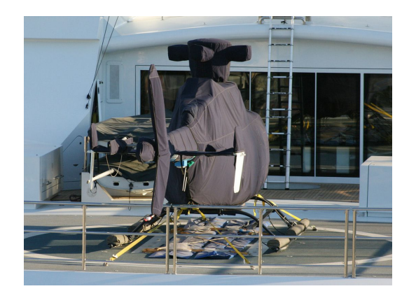
Bell 407 Complete Cover Set

WINTER USE MATERIAL - Made with Solution-Dyed Polyester fabric, this option is intended for seasonal use to aid in deicing, rain mitigation, or for occasional travel. The material is lighter and more compact, but more susceptible to UV damage and may have a shorter useful life if used continuously outside than the all-year use material.