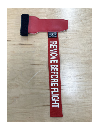
Pitot Tube Cover