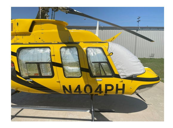
Bell 407 Windshield Cover

Heatshields are interior sunshades for an aircraft's windows or canopy glass. The product is a unique composite of closed-cell foam with a silver mylar finish. The semi-rigid design is stiff enough to stand along the inside of the windshield using sun visors or window framing. It folds up flat and easily stores in the included storage sleeve. Some designs may require velcro and suction cups. A Heatshield is an excellent short-term remedy for cockpit overheating.