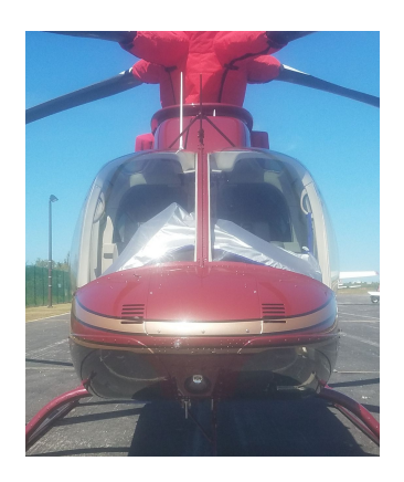
Bell 407 Insulated Rotor Mast Cover