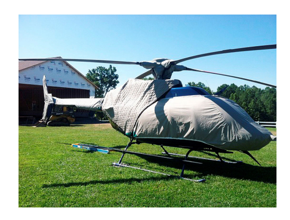
Bell 407 Covers: Bubble, Insulated Engine, Rotor Mast, Blades, Tailboom, Vertical Stabilizer and Tail Rotor