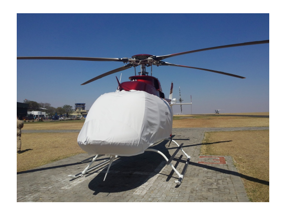
Bell 407 Bubble Cover with Wire Strike

Travel Covers are made with Silver Solution-Dyed Polyester fabric and fully lined over the entire cover. The material is lightweight and more compact for easy stowage in the aircraft. The polyester material is water resistant, but only intended for occasional use outside. We also have an ultra lightweight material available for fitted hangar dust covers. For daily outdoor use, the non-travel Sunbrella Cover is the best choice.