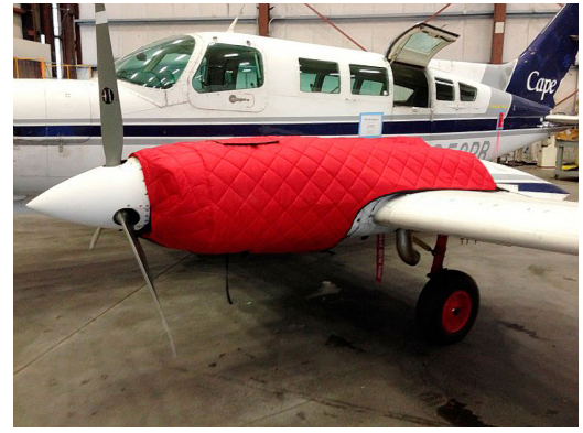
Cessna 402 Insulated Engine Cover