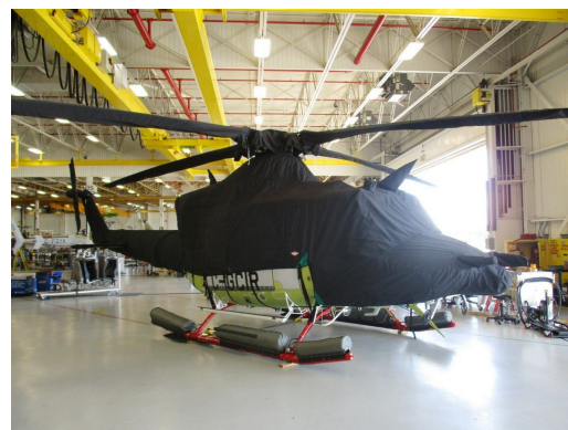
Bell 412 Cockpit/Canopy/Nose, Insulated Engine Area, Rotor Hub, Blade, Tailboom and Tail Rotor Covers