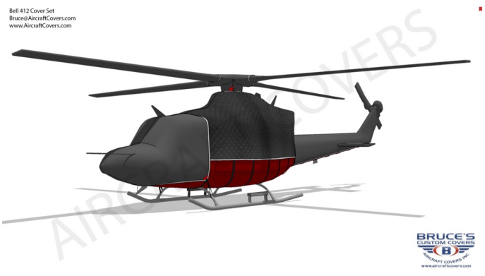
Bell 412 Forward Cabin/Nose, Insulated Engine, Tailboom, Rotor Hub & Blade Covers