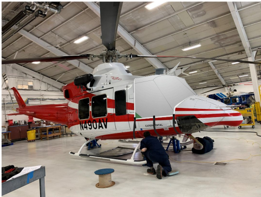
Bell 412 Cockpit/Canopy Cover, photo/illustration

Travel Covers are made with Silver Solution-Dyed Polyester fabric and fully lined over the entire cover. The material is lightweight and more compact for easy stowage in the aircraft. The polyester material is water resistant, but only intended for occasional use outside. We also have an ultra lightweight material available for fitted hangar dust covers. For daily outdoor use, the non-travel Sunbrella Cover is the best choice.