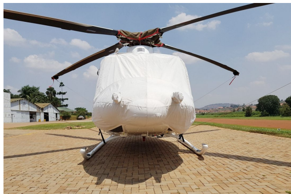
Bell 412 Cockpit/Canopy/Nose Cover

Canopy/Nose Covers enclose the entire canopy including the windshield, skylights, and chin bubble. Attachment buckles are made of nonmetal Delrin , designed for rugged outdoor use. Both the top and bottom hems of the cover have a special rope-hem feature with which they can be tightened to help prevent abrasive chafing of the windshield. Pockets are sewn into the cover for the temperature probe and pitot tubes. The bubble cover is reinforced with patches at hinge points, door handles, and for the windshield wipers. For ease of installation, the bubble cover is color-coded (red=left, green=right) with color swatches sewn into the corners. This cover type is made from Silver Acrylic Sunbrella canvas and is 100% lined with a soft and smooth microfiber. Bruce's Custom Covers developed this material combination especially for aircraft protection. The outer material is medium weight and treated for water resistance, UV resistance and anti-static buildup. The inner lining is a very soft and smooth microfiber to prevent scratching. The material is very reflective, and tests show that the cabin interior temperature can be reduced to near-ambient temperature on the hottest of days. It is water, ice and snow repellent, yet breathable to allow moisture to escape from between the cover and the aircraft surface.