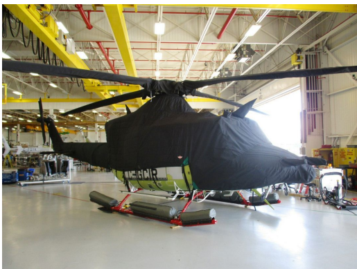
Bell 412 Cockpit/Canopy/Nose, Insulated Engine Area, Rotor Hub, Blade, Tailboom and Tail Rotor Covers