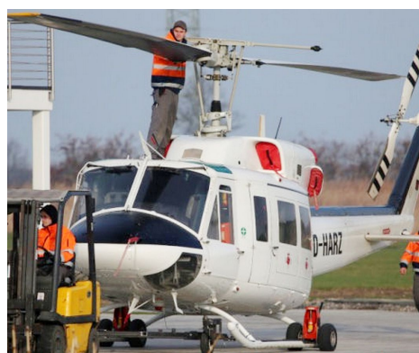
Bell 212 Main and Oil Cooler Intake Plugs