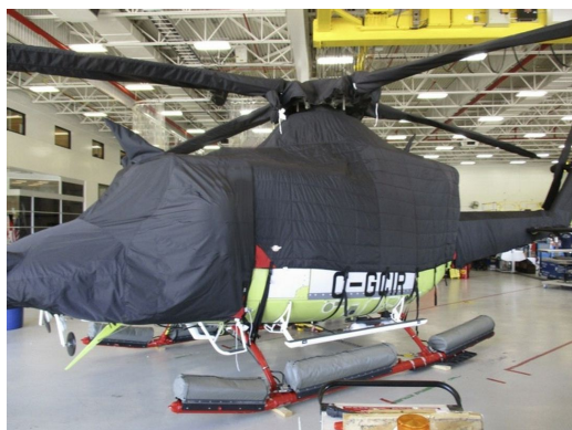
Bell 412 Cockpit/Canopy/Nose, Insulated Engine Area, Rotor Hub, Blade, Tailboom and Tail Rotor Covers

The Tailboom Cover details vary by model, but generally the helicopter tail boom cover encloses the tail boom from the "bottleneck" to the aft end. They usually also cover the horizontal stabilizers, and are custom made to allow for antennae, lights, and other protrusions. They attach with straps underneath the tail boom. Covers for the vertical and horizontal stabilizers are also available separately. Specific information for each model is available on request.