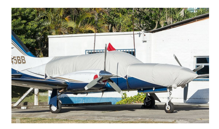
Cessna 421 Canopy Cover & Nose Cover

This cover type is made from Silver Acrylic Sunbrella canvas and is 100% lined with a soft and smooth microfiber. Bruce's Custom Covers developed this material combination especially for aircraft protection. The outer material is medium weight and treated for water resistance, UV resistance and anti-static buildup. The inner lining is a very soft and smooth microfiber to prevent scratching. The material is very reflective, and tests show that the cabin interior temperature can be reduced to near-ambient temperature on the hottest of days. It is water, ice and snow repellent, yet breathable to allow moisture to escape from between the cover and the aircraft surface.