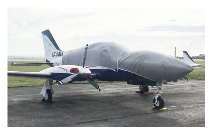
Cessna 414 Travel Cover, Light Weight Canopy Cover