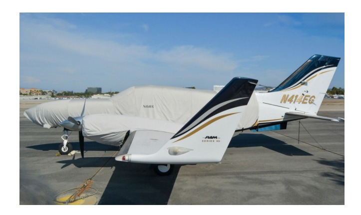
Cessna 414A Extended Canopy/Nose Cover & Engine Covers

This cover type is made from Silver Acrylic Sunbrella canvas and is 100% lined with a soft and smooth microfiber. Bruce's Custom Covers developed this material combination especially for aircraft protection. The outer material is medium weight and treated for water resistance, UV resistance and anti-static buildup. The inner lining is a very soft and smooth microfiber to prevent scratching. The material is very reflective, and tests show that the cabin interior temperature can be reduced to near-ambient temperature on the hottest of days. It is water, ice and snow repellent, yet breathable to allow moisture to escape from between the cover and the aircraft surface.