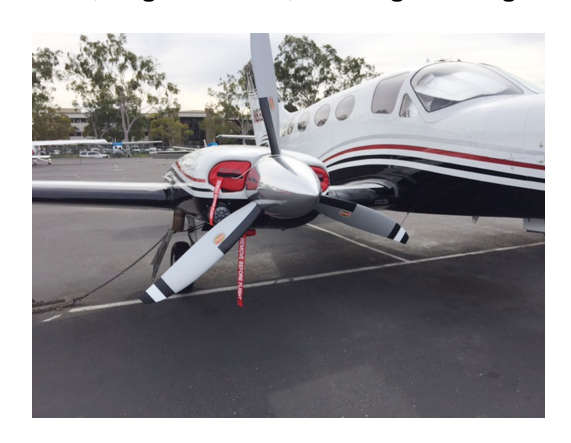
Cessna 414 Engine Inlet Plugs

Engine Inlet Plugs are custom fit for your Cessna 414, 414A intakes, made with heavy-duty vinyl material, and stuffed with a single block of sculpted urethane foam. Each plug has a zipper that allows the foam to be removed and dried if necessary. Engine plugs have warning flags that are visible from the cockpit or 'remove before flight' streamers sewn onto the face of the plugs. Most plugs are imprinted with the aircraft registration number in black for an extra charge. Storage bag NOT included. Engine plugs may be inserted after flight when the engine is still warm. Engine Inlet Plugs are commonly referred to as Cowl Plugs, Intake Plugs, Cowl Blocks, Engine Blocks, and Engine Bungs.