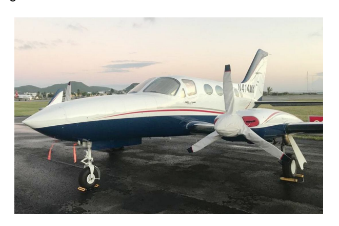
Cessna 414 Propellor/Spinner Covers, 3 Blade