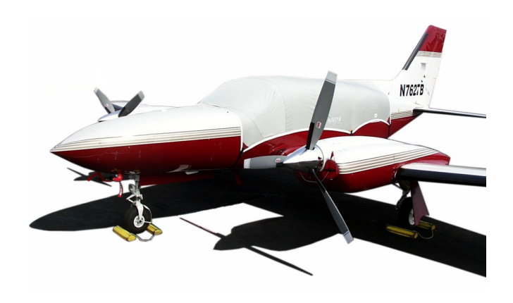
Cessna 421C Canopy Cover & Engine Plugs