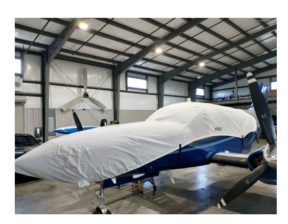
Cessna 421B Canopy/Nose Cover