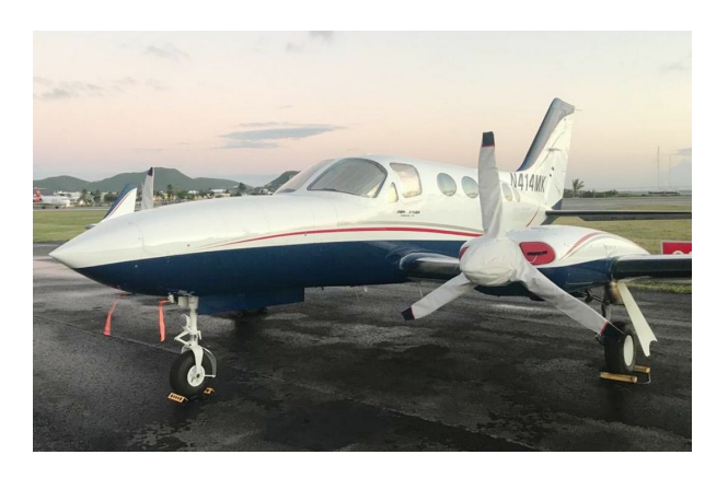
Cessna 414 Propellor/Spinner Covers, 3 Blade