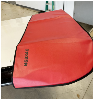
Cessna 421C Wingtip Pads

Designed to prevent damage to the aircraft extremities in crowded hangars, these products are made of bright red Naugahyde and thickly padded with a sandwich of closed cell foam. Nowadays they are also made using bright red Neoprene padded laminated (think: wetsuit material).