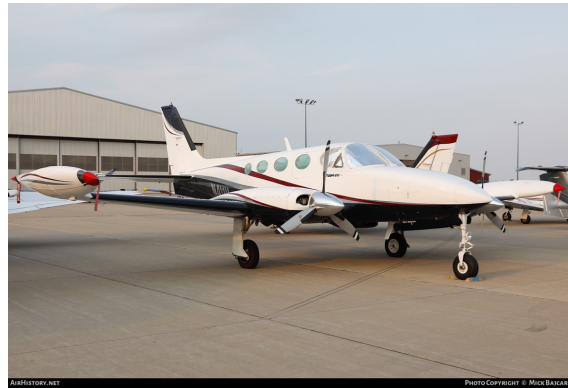
Cessna 340 Wingtip Pads