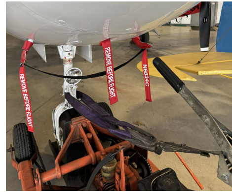
Cessna 421C Pitot Covers, Nose Inlet Plug