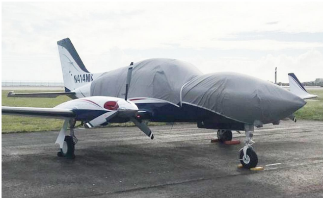
Cessna 414 Travel Cover, Light Weight Canopy Cover

Travel Covers are made with Silver Solution-Dyed Polyester fabric and only lined over the windshield to save weight. The material is lightweight and more compact for easy stowage in the aircraft. The polyester material is water resistant, but only intended for occasional use outside. We also have an ultra lightweight material available for fitted hangar dust covers. For daily outdoor use, the non-travel Sunbrella Cover is the best choice.