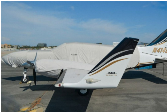
Cessna 414 Extended Canopy/Nose Cover, Engine Covers

This cover type is made from Silver Acrylic Sunbrella canvas and is 100% lined with a soft and smooth microfiber. Bruce's Custom Covers developed this material combination especially for aircraft protection. The outer material is medium weight and treated for water resistance, UV resistance and anti-static buildup. The inner lining is a very soft and smooth microfiber to prevent scratching. The material is very reflective, and tests show that the cabin interior temperature can be reduced to near-ambient temperature on the hottest of days. It is water, ice and snow repellent, yet breathable to allow moisture to escape from between the cover and the aircraft surface.