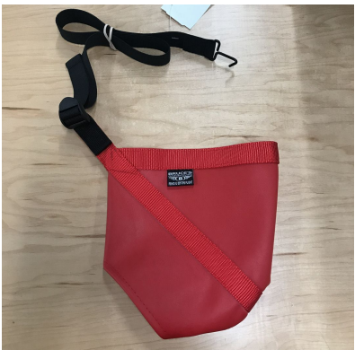
ATR-72-202 Insulated Engine & Prop Hub Covers Prop Tie-Down, Various Models (secures with a hook to engine nacelle)