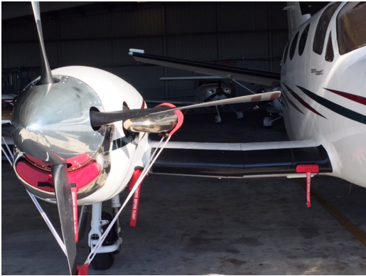
Cessna Conquest I Prop Tie/Exhaust Covers, Engine Plugs

plugs are imprinted with the aircraft registration number in black for an extra charge. Storage bag NOT included. Engine plugs may be inserted after flight when the engine is still warm. Engine Inlet Plugs are commonly referred to as Cowl Plugs, Intake Plugs, Cowl Blocks, Engine Blocks, and Engine Bungs.