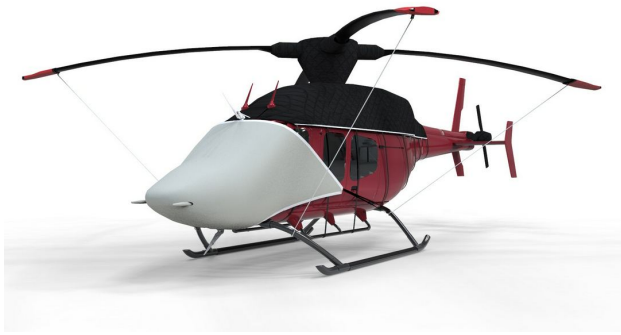
Bell 429 Cockpit/Nose Cover, Engine Cover, etc.