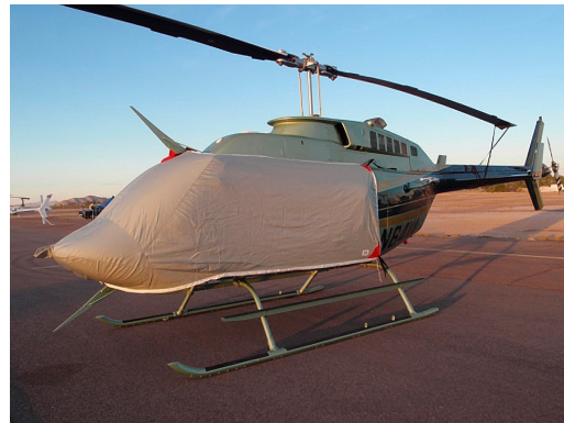
Bell 206L Longranger Bubble Cover