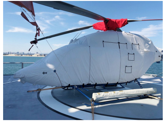
Bell 429 Main Body Cover