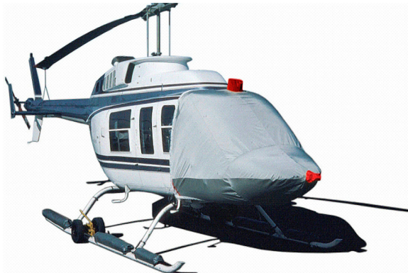
Cockpit Cover on Bell 206L

Travel Covers are made with Silver Solution-Dyed Polyester fabric and fully lined over the entire cover. The material is lightweight and more compact for easy stowage in the aircraft. The polyester material is water resistant, but only intended for occasional use outside. We also have an ultra lightweight material available for fitted hangar dust covers. For daily outdoor use, the non-travel Sunbrella Cover is the best choice.