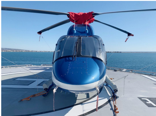
Bell 429 Windshield HeatShields, Rotor Mast Cover

WINTER USE MATERIAL - Made with Solution-Dyed Polyester fabric, this option is intended for seasonal use to aid in deicing, rain mitigation, or for occasional travel. The material is lighter and more compact, but more susceptible to UV damage and may have a shorter useful life if used continuously outside than the all-year use material.