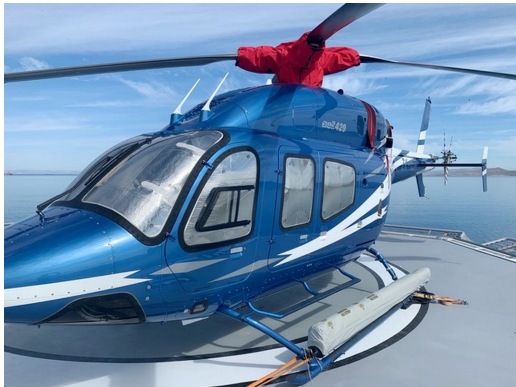
Bell 429 Rotor Hub Cover, Cockpit & Cabin HeatShields