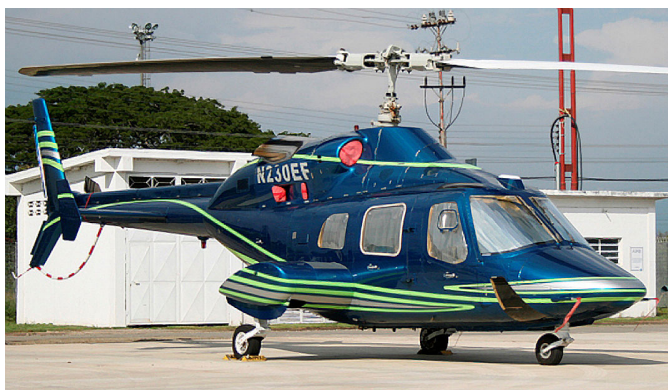
Bell 230 Engine Plugs, HeatShields