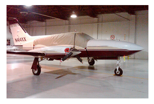
Cessna 414 Canopy Cover and Engine Inlet Plugs

Travel Covers are made with Silver Solution-Dyed Polyester fabric and only lined over the windshield to save weight. The material is lightweight and more compact for easy stowage in the aircraft. The polyester material is water resistant, but only intended for occasional use outside. We also have an ultra lightweight material available for fitted hangar dust covers. For daily outdoor use, the non-travel Sunbrella Cover is the best choice.