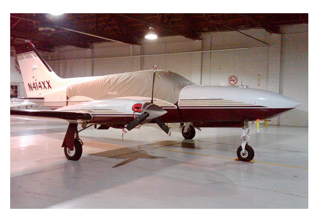
Cessna 414 Canopy Cover and Engine Inlet Plugs