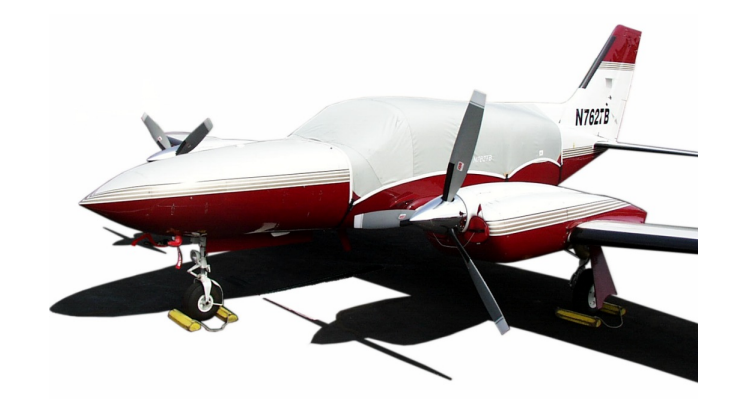
Cessna 421C Canopy Cover & Engine Plugs

Cessna Conquest I Prop Tie/Exhaust Covers, Engine Plugs