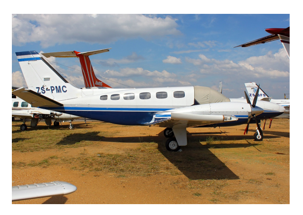
Cessna 441 Conquest II Cockpit Cover

Covers developed this material combination especially for aircraft protection. The outer material is medium weight and treated for water resistance, UV resistance and anti-static buildup. The inner lining is a very soft and smooth microfiber to prevent scratching. The material is very reflective, and tests show that the cabin interior temperature can be reduced to near-ambient temperature on the hottest of days. It is water, ice and snow repellent, yet breathable to allow moisture to escape from between the cover and the aircraft surface.