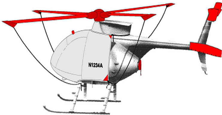
Full Cover Set

WINTER USE MATERIAL - Made with Solution-Dyed Polyester fabric, this option is intended for seasonal use to aid in deicing, rain mitigation, or for occasional travel. The material is lighter and more compact, but more susceptible to UV damage and may have a shorter useful life if used continuously outside than the all-year use material.