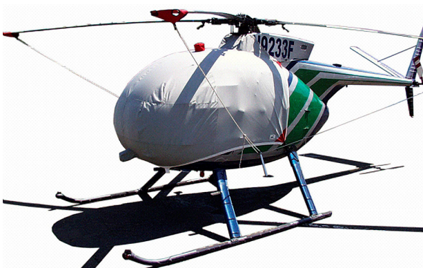
Hughes 500C Bubble Cover with Intake Add-on, Blade Tie-downs

Travel Covers are made with Silver Solution-Dyed Polyester fabric and fully lined over the entire cover. The material is lightweight and more compact for easy stowage in the aircraft. The polyester material is water resistant, but only intended for occasional use outside. We also have an ultra lightweight material available for fitted hangar dust covers. For daily outdoor use, the non-travel Sunbrella Cover is the best choice.