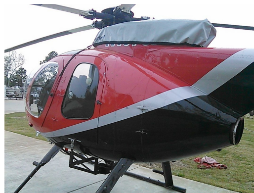
Customized Engine Cover