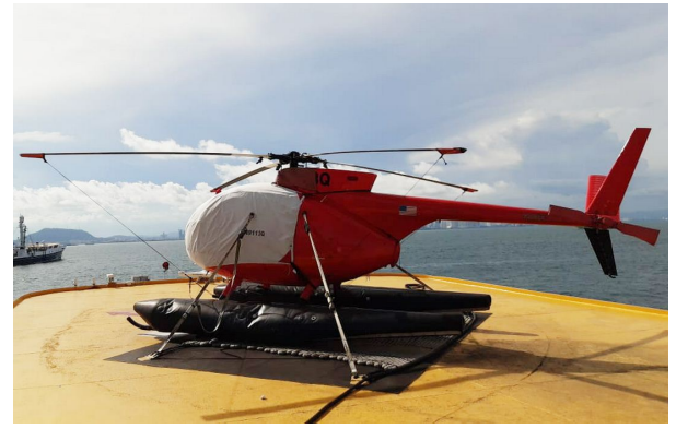
Hughes 500D Bubble Cover with Wire Strike detail and Blade Tie-downs Hughes 500C (369HS) Bubble Cover, Blade Tie-Downs