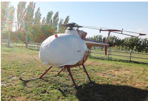
MD500D Bubble Cover with Intake Add-On

Travel Covers are made with Silver Solution-Dyed Polyester fabric and fully lined over the entire cover. The material is lightweight and more compact for easy storage in the aircraft. The polyester material is water resistant, but only intended for occasional use outside. We also have an ultra lightweight material available for fitted hangar dust covers. For daily outdoor use, the non-travel Sunbrella Cover is the best choice.