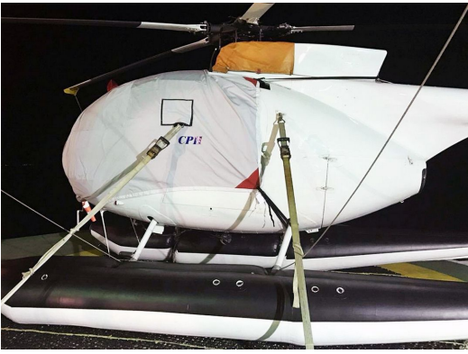
Customized with tie-down access flaps