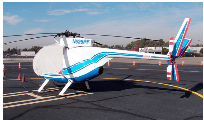
MD500C Bubble Cover with Wire Strike detail