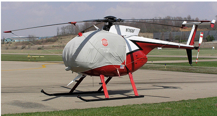
Hughes 500D Bubble Cover with Wire Strike detail and Blade Tie-downs

Travel Covers are made with Silver Solution-Dyed Polyester fabric and fully lined over the entire cover. The material is lightweight and more compact for easy storage in the aircraft. The polyester material is water resistant, but only intended for occasional use outside. We also have an ultra lightweight material available for fitted hangar dust covers. For daily outdoor use, the non-travel Sunbrella Cover is the best choice.