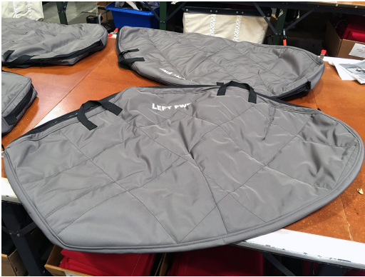
Protective Door Bags

**Padded Door Bags* are designed to provide portable protection of the doors when they are removed from the aircraft. They are padded to moderate thickness, zippered closed, and have sturdy carry handles for easy transport.