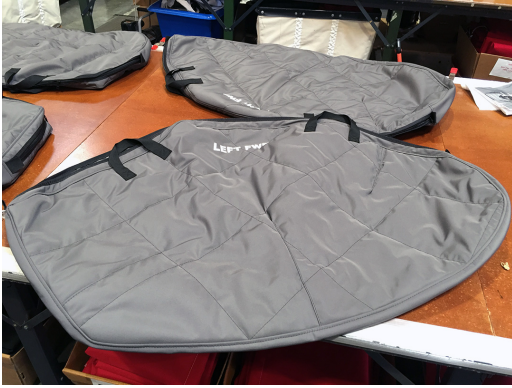
Protective Door Bags

**Padded Door Bags* are designed to provide portable protection of the doors when they are removed from the aircraft. They are padded to moderate thickness, zippered closed, and have sturdy carry handles for easy transport.