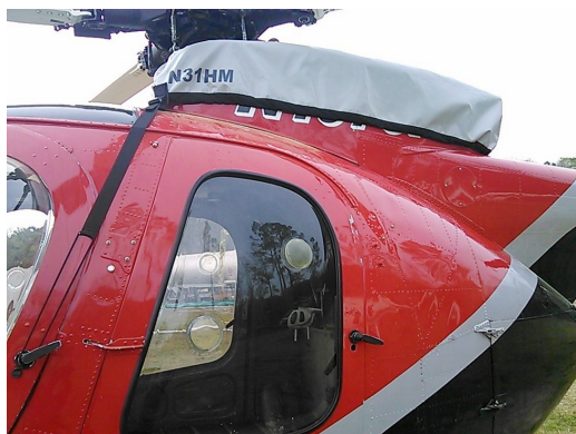
Customized Engine Cover

WINTER USE MATERIAL - Made with Solution-Dyed Polyester fabric, this option is intended for seasonal use to aid in deicing, rain mitigation, or for occasional travel. The material is lighter and more compact, but more susceptible to UV damage and may have a shorter useful life if used continuously outside than the all-year use material.