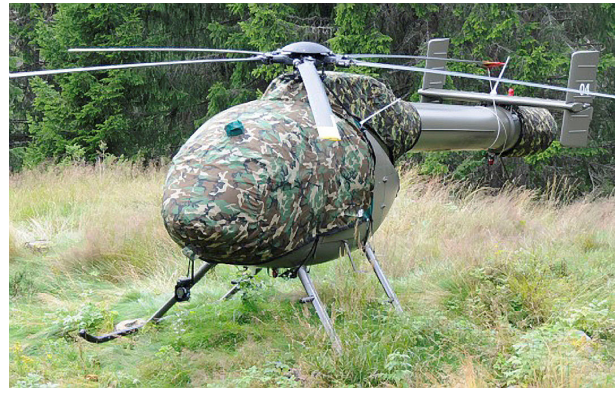
MD520 NOTAR Bubble, Engine, & NOTAR Covers & Blade Tie-downs