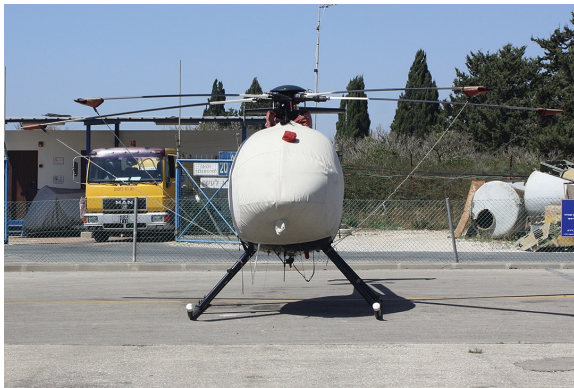
MD-500E Bubble Cover, Blade Tie-Downs

WINTER USE MATERIAL - Made with Solution-Dyed Polyester fabric, this option is intended for seasonal use to aid in deicing, rain mitigation, or for occasional travel. The material is lighter and more compact, but more susceptible to UV damage and may have a shorter useful life if used continuously outside than the all-year use material.