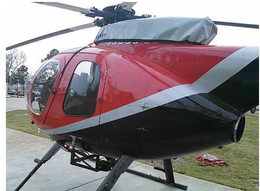
Customized Engine Cover