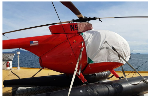
Hughes 500C (369HS) Bubble Cover