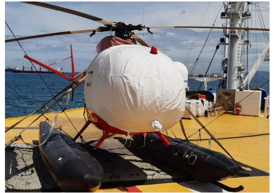
Hughes 500C (369HS) Bubble Cover