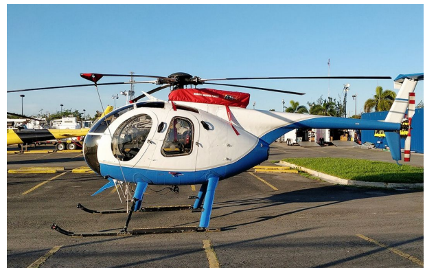
Hughes 500D Blade Tie-Downs, Doghouse Cover