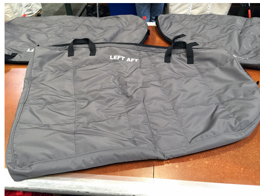
Protective Door Bags