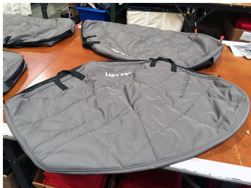
Protective Door Bags

**Padded Door Bags* are designed to provide portable protection of the doors when they are removed from the aircraft. They are padded to moderate thickness, zippered closed, and have sturdy carry handles for easy transport.