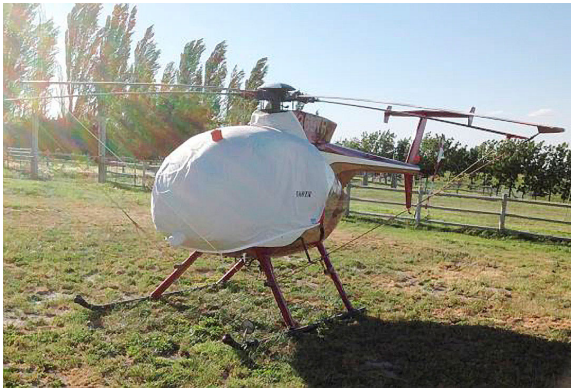
MD500D Bubble Cover with Intake Add-On