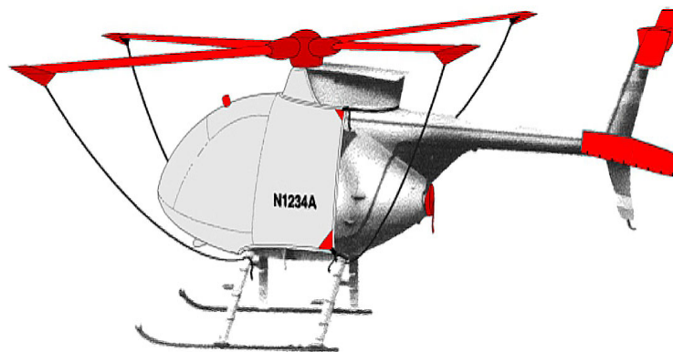
Full Cover Set

The Tailboom Cover details vary by model, but generally the helicopter tail boom cover encloses the tail boom from the "bottleneck" to the aft end. They usually also cover the horizontal stabilizers, and are custom made to allow for antennae, lights, and other protrusions. They attach with straps underneath the tail boom. Covers for the vertical and horizontal stabilizers are also available separately. Specific information for each model is available on request.