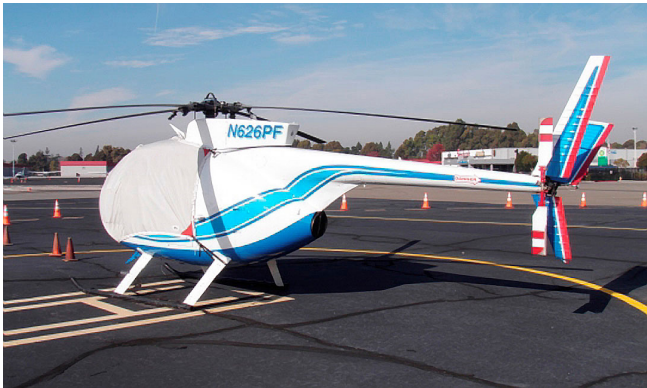
MD500C Bubble Cover with Wire Strike detail

Travel Covers are made with Silver Solution-Dyed Polyester fabric and fully lined over the entire cover. The material is lightweight and more compact for easy stowage in the aircraft. The polyester material is water resistant, but only intended for occasional use outside. We also have an ultra lightweight material available for fitted hangar dust covers. For daily outdoor use, the non-travel Sunbrella Cover is the best choice.