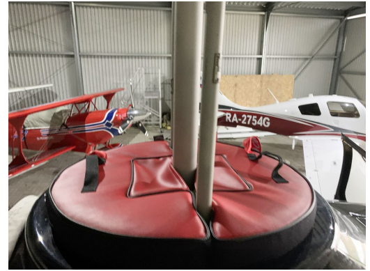
Bell 505 Jet Ranger X Swash Plate Plug