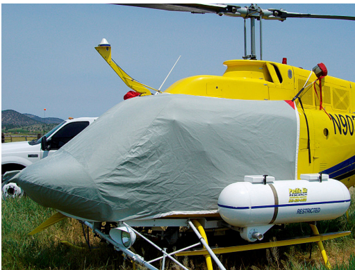
206B Bubble Cover

Travel Covers are made with Silver Solution-Dyed Polyester fabric and fully lined over the entire cover. The material is lightweight and more compact for easy storage in the aircraft. The polyester material is water resistant, but only intended for occasional use outside. We also have an ultra lightweight material available for fitted hangar dust covers. For daily outdoor use, the non-travel Sunbrella Cover is the best choice.