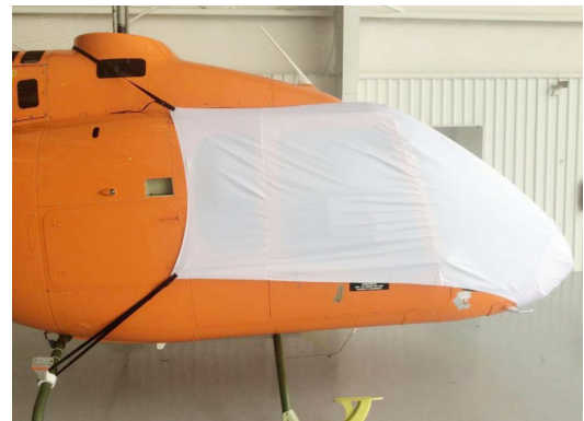
Bell 505 Bubble Cover, test fit cover.