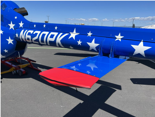
Bell 505 Horizontal Stabilizer Tip Pads

Designed to prevent damage to the aircraft extremities in crowded hangars, these products are made of bright red Naugahyde and thickly padded with a sandwich of closed cell foam.