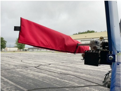
Bell 505 Jet Ranger X Tail Rotor Cover