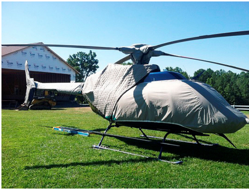
Bell 407 Covers: Bubble, Insulated Engine, Rotor Mast, Blades, Tailboom, Vertical Stabilizer and Tail Rotor