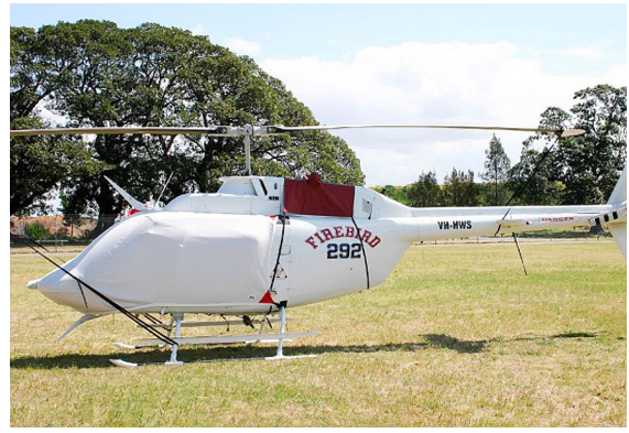
206B Bubble Cover