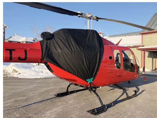
Bell 505 Engine Cover