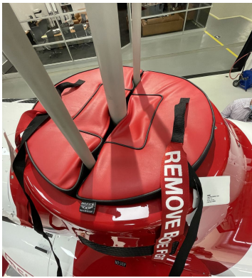
Bell 505 Swash Plate Plug

The Engine Inlet Plugs are custom fit for your Bell 505 Jet Ranger X intakes, made with heavy-duty vinyl material, and stuffed with a single block of sculpted urethane foam. Each plug has a zipper that allows the foam to be removed and dried if necessary. Engine plugs have 'Remove Before Flight' streamers sewn onto the face of the plugs. Most plugs are imprinted with the aircraft registration number in black for an extra charge. Storage bag NOT included. Engine plugs may be inserted after flight when the engine is still warm. Engine Inlet Plugs are commonly referred to as Cowl Plugs, Intake Plugs, Cowl Blocks, Engine Blocks, and Engine Bungs.