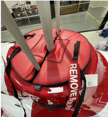
Bell 407 Covers: Bubble, Insulated Engine, Rotor Mast, Blades, Tailboom, Vertical Stabilizer and Tail Rotor Bell 505 Swash Plate Plug