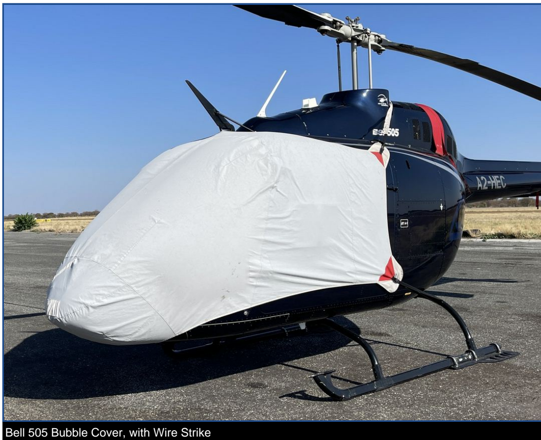
Bell 505 Bubble Cover, with Wire Strike