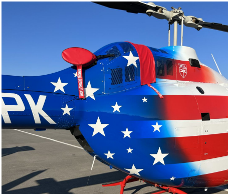
Bell 505 Exhaust & Intake Filter Covers

WINTER USE MATERIAL - Made with Solution-Dyed Polyester fabric, this option is intended for seasonal use to aid in deicing, rain mitigation, or for occasional travel. The material is lighter and more compact, but more susceptible to UV damage and may have a shorter useful life if used continuously outside than the all-year use material.