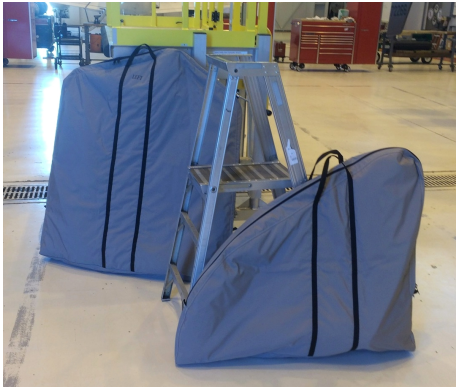
Eurocopter EC-145 Padded Bags for Removable Doors

**Padded Door Bags* are designed to provide portable protection of the doors when they are removed from the aircraft. They are padded to moderate thickness, zippered closed, and have sturdy carry handles for easy transport.