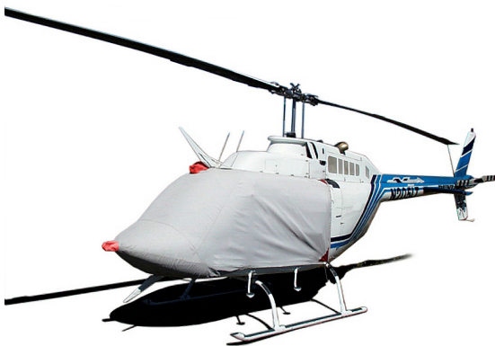
JetRanger Bubble Cover

Travel Covers are made with Silver Solution-Dyed Polyester fabric and fully lined over the entire cover. The material is lightweight and more compact for easy storage in the aircraft. The polyester material is water resistant, but only intended for occasional use outside. We also have an ultra lightweight material available for fitted hangar dust covers. For daily outdoor use, the non-travel Sunbrella Cover is the best choice.