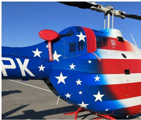
Bell 505 Exhaust & Intake Filter Covers

WINTER USE MATERIAL - Made with Solution-Dyed Polyester fabric, this option is intended for seasonal use to aid in deicing, rain mitigation, or for occasional travel. The material is lighter and more compact, but more susceptible to UV damage and may have a shorter useful life if used continuously outside than the all-year use material.