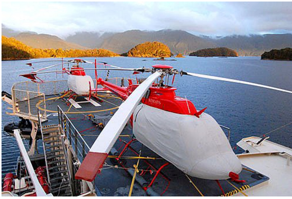
Bell 407 Bubble Cover