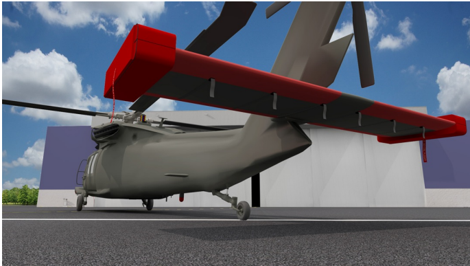
Padded Horizontal Stab Covers, Wingtip Pads (illustration)