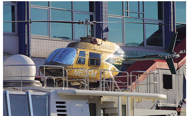
Bell 206B Jetranger Windshield HeatShields