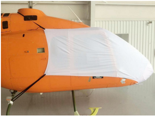
Bell 505 Bubble Cover, test fit cover.