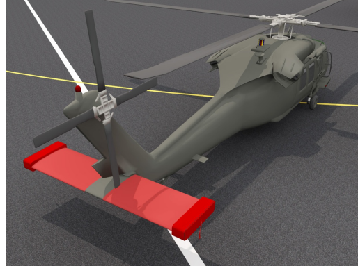
Padded Horizontal Stab Covers, Wingtip Pads (illustration)