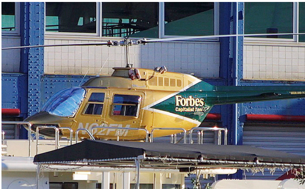
Bell 206B Jetranger Windshield HeatShields