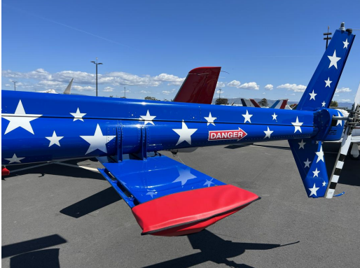
Bell 505 Horizontal Stabilizer Tip Pads

Designed to prevent damage to the aircraft extremities in crowded hangars, these products are made of bright red Naugahyde and thickly padded with a sandwich of closed cell foam.