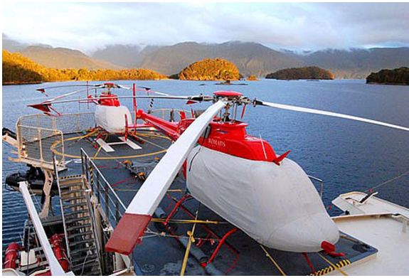
Bell 407 Bubble Cover