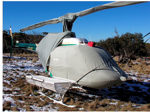
JetRanger Bubble, Engine, Rotor Hub & Blade Covers (& Tie-Downs)