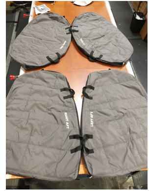
MD 500D Padded Door Bags