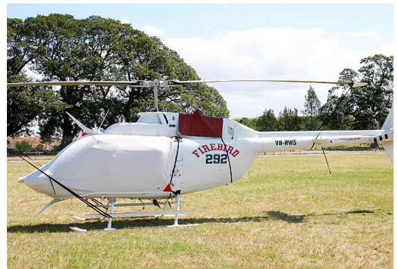
206B Bubble Cover