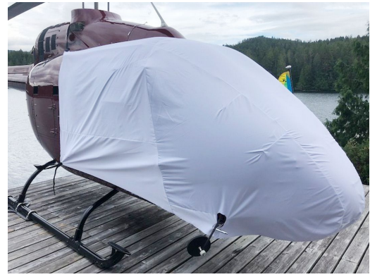
Bell 505 Bubble Cover, test fit cover