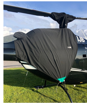
Bell 505 Engine, Rotor Mast & Blade Covers