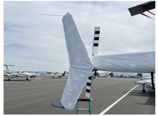
Bell 505 Tailboom & Stabilizer Covers, test fit cover