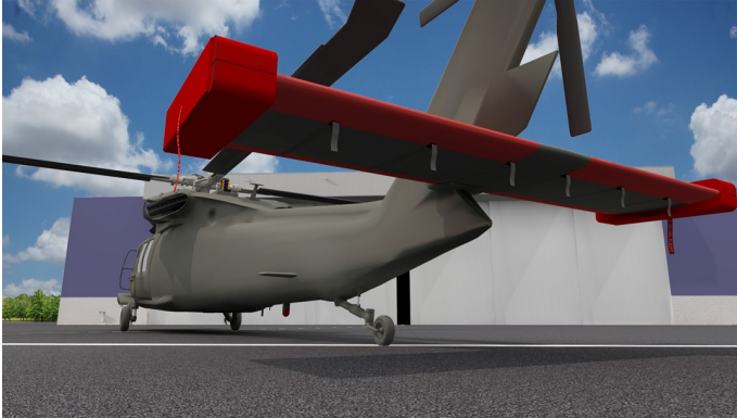
Padded Horizontal Stab Covers, Wingtip Pads (illustration)

Designed to prevent damage to the aircraft extremities in crowded hangars, these products are made of bright red Naugahyde and thickly padded with a sandwich of closed cell foam.