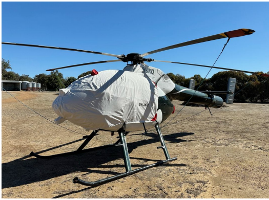
MDD 520 NOTAR Bubble Cover w/Intake Cover Add-On