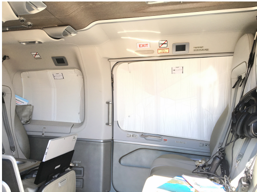
Eurocopter EC-145 Cabin Heatshields

Cockpit Heatshields are interior sunshades for the aircraft's cockpit. The product is a unique composite of closed-cell foam with a silver mylar finish. The semi-rigid design is stiff enough to stand inside the window framing. Darts and folds are incorporated into the material so that it conforms to the complex shape of the helicopter windows. The set folds up flat and is easily stored in the included storage sleeve. Some designs may require velcro and suction cups. A Heatshield is an excellent short-term remedy for cockpit overheating, but an external fabric cover is more effective for long-term protection.