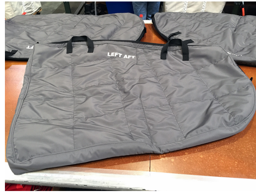
Protective Door Bags