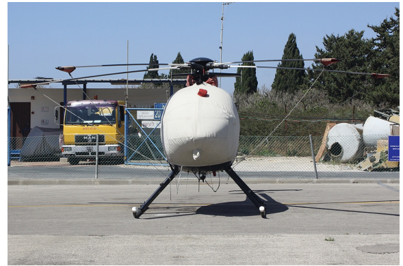
MD-500E Bubble Cover, Blade Tie-Downs