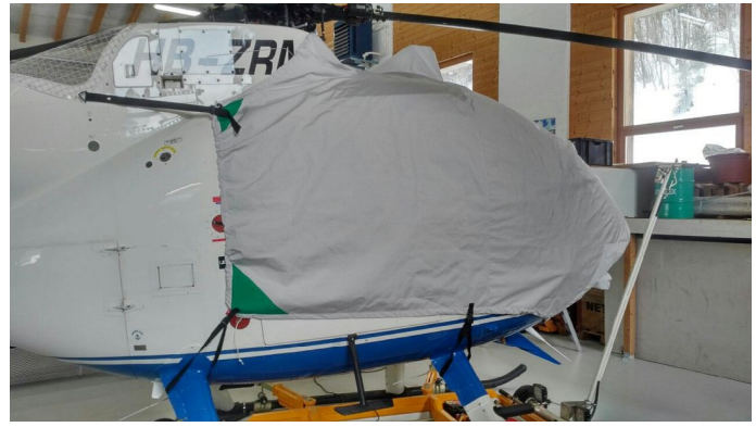
MD520 Bubble Cover with Intake Cover Add-On