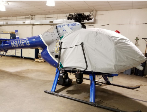
McDonnell Douglas MDD 520 Notar Bubble Cover, with special missions equipment.

Travel Covers are made with Silver Solution-Dyed Polyester fabric and fully lined over the entire cover. The material is lightweight and more compact for easy stowage in the aircraft. The polyester material is water resistant, but only intended for occasional use outside. We also have an ultra lightweight material available for fitted hangar dust covers. For daily outdoor use, the non-travel Sunbrella Cover is the best choice.