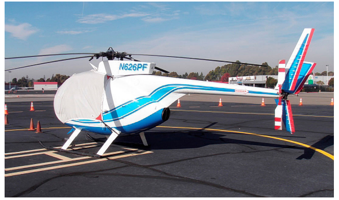
MD500C Bubble Cover with Wire Strike detail