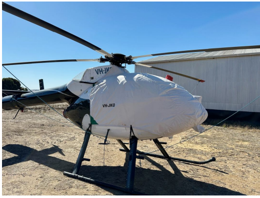
MDD 520 NOTAR Bubble Cover w/Intake Cover Add-On