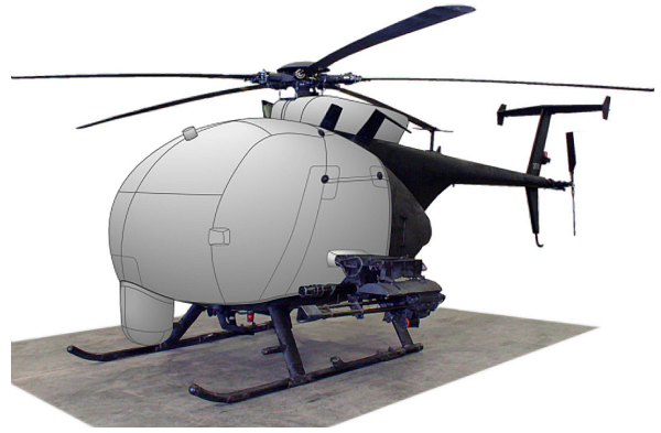
MH-6J Bubble, Flir & Doghouse Covers (illustration)