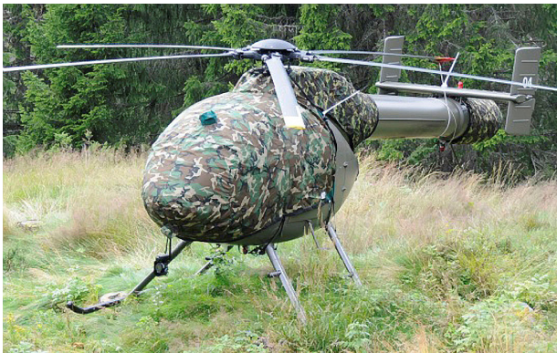
MD520 NOTAR Bubble, Engine, & NOTAR Covers & Blade Tie-downs

The Tailboom Cover details vary by model, but generally the helicopter tail boom cover encloses the tail boom from the "bottleneck" to the aft end. They usually also cover the horizontal stabilizers, and are custom made to allow for antennae, lights, and other protrusions. They attach with straps underneath the tail boom. Covers for the vertical and horizontal stabilizers are also available separately. Specific information for each model is available on request.