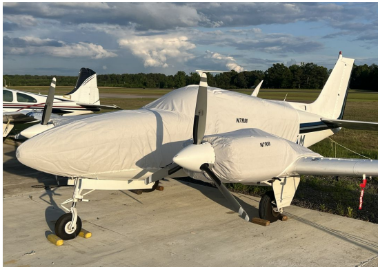
Beech C55 Baron Extended Canopy/Nose Cover, Engine Covers