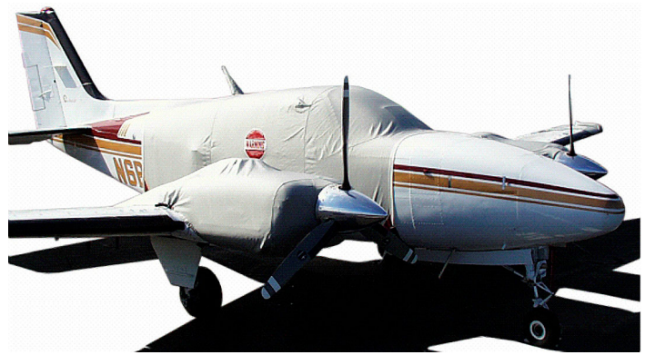
Standard Canopy Cover & Engine Plugs. Extended Canopy Cover & Engine Cover