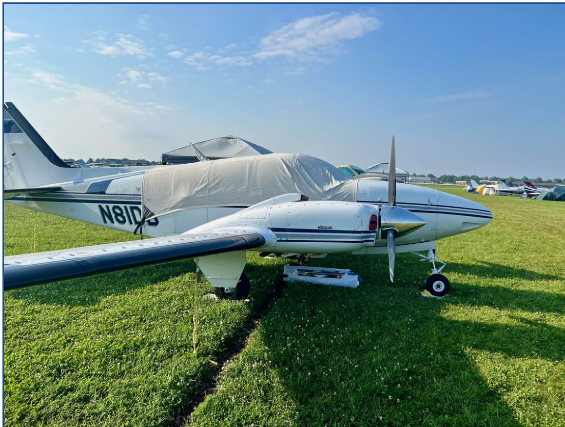
Beech Baron 58 Canopy Cover