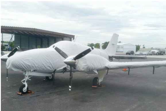
Full Cover Set (58P-020, 58P-225, 58P-405)

WINTER USE MATERIAL - Made with Solution-Dyed Polyester fabric, this option is intended for seasonal use to aid in deicing, rain mitigation, or for occasional travel. The material is lighter and more compact, but more susceptible to UV damage and may have a shorter useful life if used continuously outside than the all-year use material.