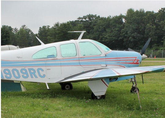
Beech Bonanza/Debonair HeatShield Set

Windshield Heatshields are interior sunshades for an aircraft's front windshield. The product is a unique composite of closed-cell foam with a silver mylar finish. The semi-rigid design is stiff enough to stand along the inside of the windshield using sun visors or window framing. It folds up flat and easily stores in the included storage sleeve. Some designs may require velcro and suction cups or split right and left sides. A Heatshield is an excellent short-term remedy for cockpit overheating. An external fabric cover is far more effective and practical for long-term protection.