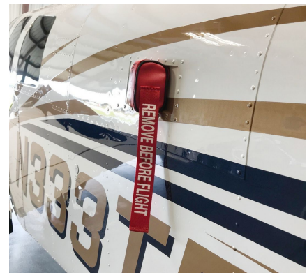
Beech Baron Fresh Air Outlet Plug