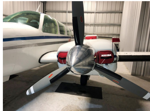
Beech Baron Engine Plugs