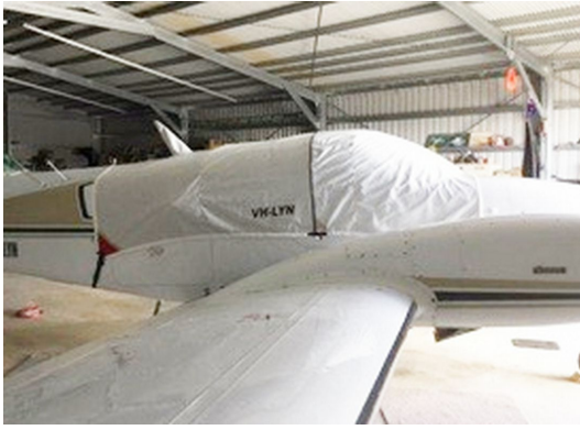
Beech Baron B-55 Canopy Cover