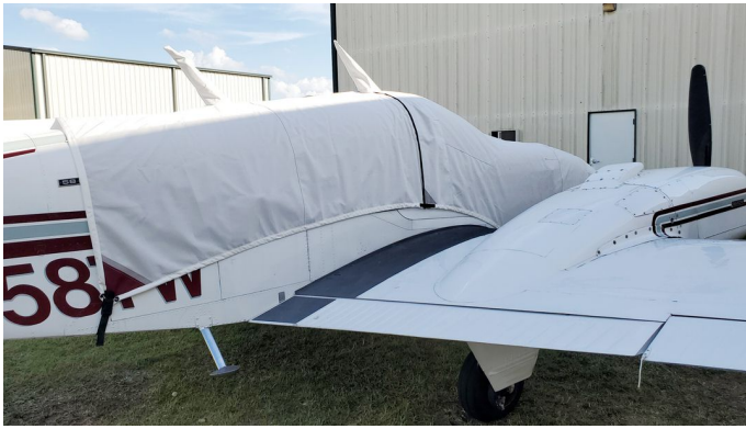
Beech Baron 58 Canopy/Nose Cover