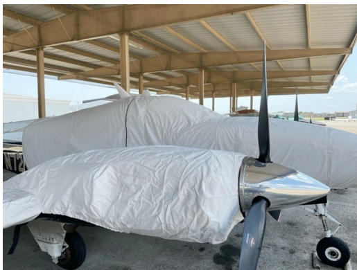
Beech Baron 58P Extended Canopy/Nose Cover, Wing/Engine Covers (test fit)