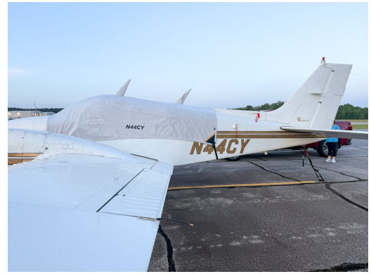
Beech Baron B55 Canopy Cover