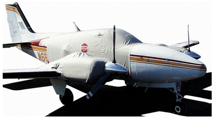
Beech Baron B55 Insulated Engine Covers Standard Canopy Cover & Engine Plugs. Extended Canopy Cover & Engine Cover