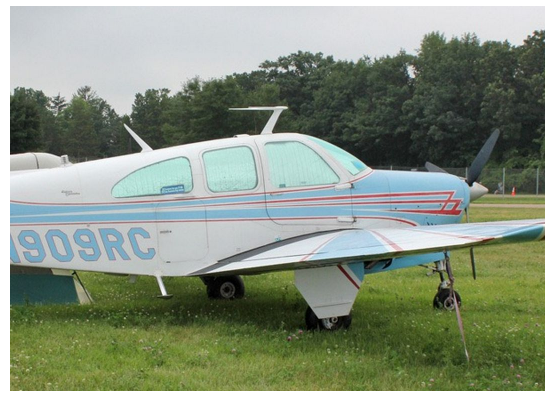
Beech Bonanza/Debonair HeatShield Set