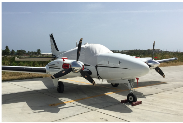
Baron 58 Canopy Cover, Engine Plugs