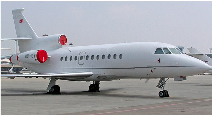
Falcon 900 Engine Covers, hook detail