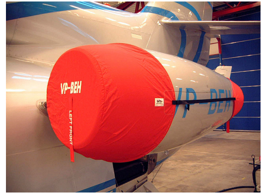
Falcon 900 Engine Covers, outboard & inboard strap detail