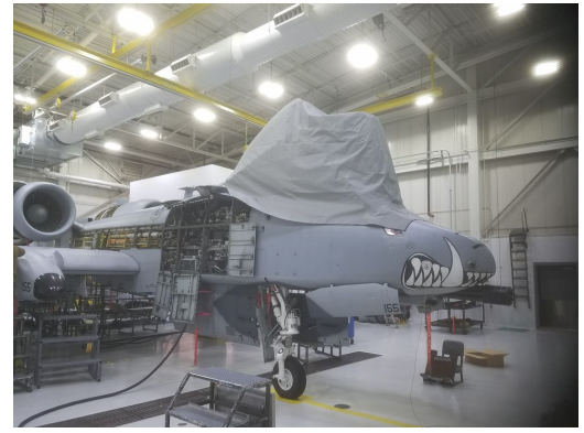
Fairchild A-10 Canopy Cover, open position