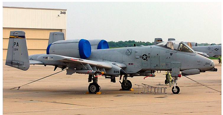
A-10 Engine Covers