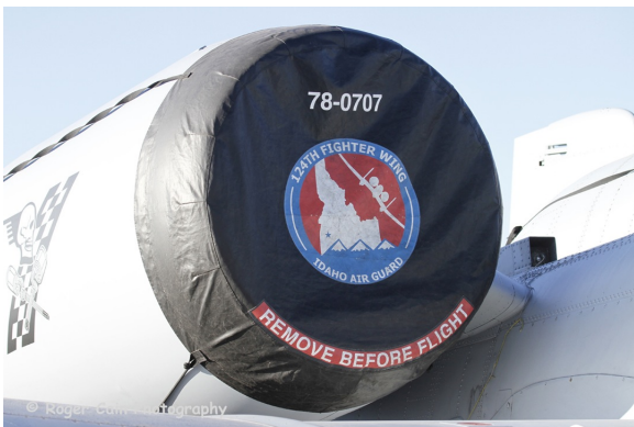
Fairchild A-10 Engine Covers

ALL-YEAR USE MATERIAL - Made with Solution dyed Polyester fabric, the all-year use material is the best option for sun protection and cover longevity. This heavier more durable material is intended for all weather conditions, such as rain and snow or lots of sun.