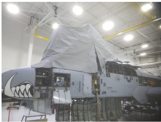
Fairchild A-10 Canopy Cover, open position