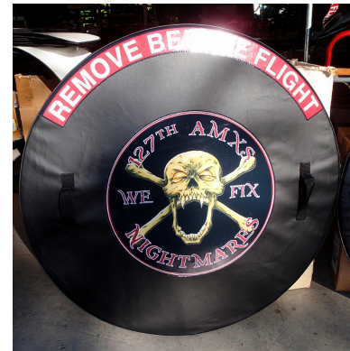
A-10 Engine Intake Plug