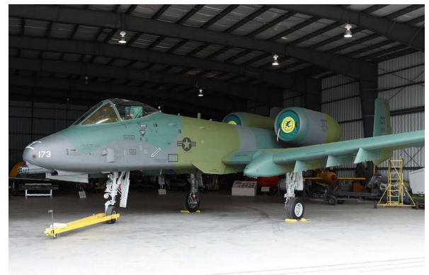
Fairchild A10 Intake Plugs, non-folding type