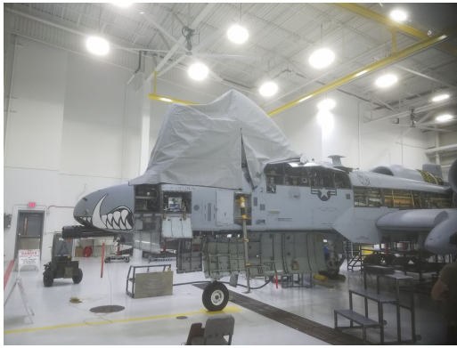
Fairchild A-10 Canopy Cover, open position