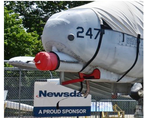
Fairchild A10 Thunderbolt Nose Gun Cover, Gun Scoop Inlet Plug