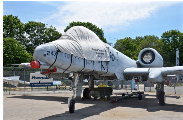
Fairchild A10 Thunderbolt Nose Gun Cover, Gun Scoop Inlet Plug