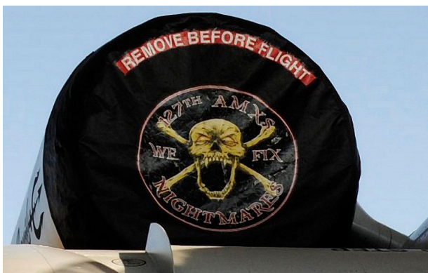
A-10 Engine Covers with Custom Artwork

ALL-YEAR USE MATERIAL - Made with Solution dyed Polyester fabric, the all-year use material is the best option for sun protection and cover longevity. This heavier more durable material is intended for all weather conditions, such as rain and snow or lots of sun.