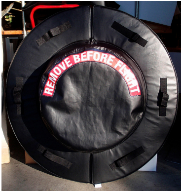
A-10 Exhaust Plug/Cover