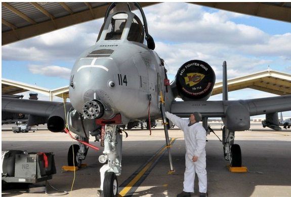
Fairchild A10 Intake Covers & Nose Gun Scoop Plug

The Engine Inlet Plugs are custom fit for your Fairchild A10 Thunderbolt intakes, made with heavy-duty vinyl material, and stuffed with a single block of sculpted urethane foam. Each plug has a zipper that allows the foam to be removed and dried if necessary. Engine plugs have 'remove before flight' streamers sewn onto the face of the plugs. Most plugs are imprinted with the aircraft registration number in black for an extra charge. Storage bag NOT included. Engine plugs may be inserted after flight when the engine is still warm. Engine Inlet Plugs are commonly referred to as Cowl Plugs, Intake Plugs, Cowl Blocks, Engine Blocks, and Engine Bungs.