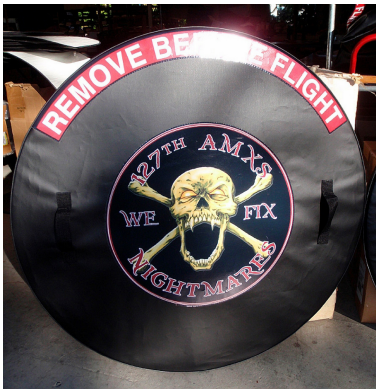
A-10 Engine Intake Plug