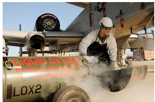
A-10 Engine Intake Cover