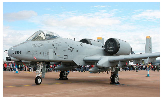
A-10 Engine Covers with Custom Artwork