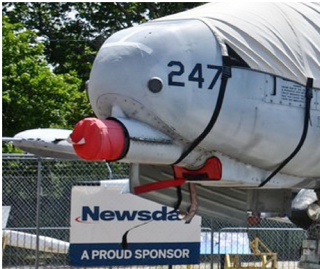
Fairchild A10 Thunderbolt Nose Gun Cover, Gun Scoop Inlet Plug

ALL-YEAR USE MATERIAL - Made with Silver Acrylic Sunbrella canvas, the all-year use material is the best option for sun protection and cover longevity. This heavier more durable material is intended for all weather conditions, such as rain and snow or lots of sun.