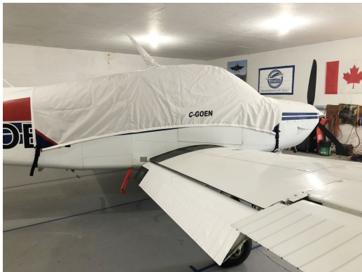
Beech Sierra B24R Canopy Cover

This cover type is made from Silver Acrylic Sunbrella canvas and is 100% lined with a soft and smooth microfiber. Bruce's Custom Covers developed this material combination especially for aircraft protection. The outer material is medium weight and treated for water resistance, UV resistance and anti-static buildup. The inner lining is a very soft and smooth microfiber to prevent scratching. The material is very reflective, and tests show that the cabin interior temperature can be reduced to near-ambient temperature on the hottest of days. It is water, ice and snow repellent, yet breathable to allow moisture to escape from between the cover and the aircraft surface.