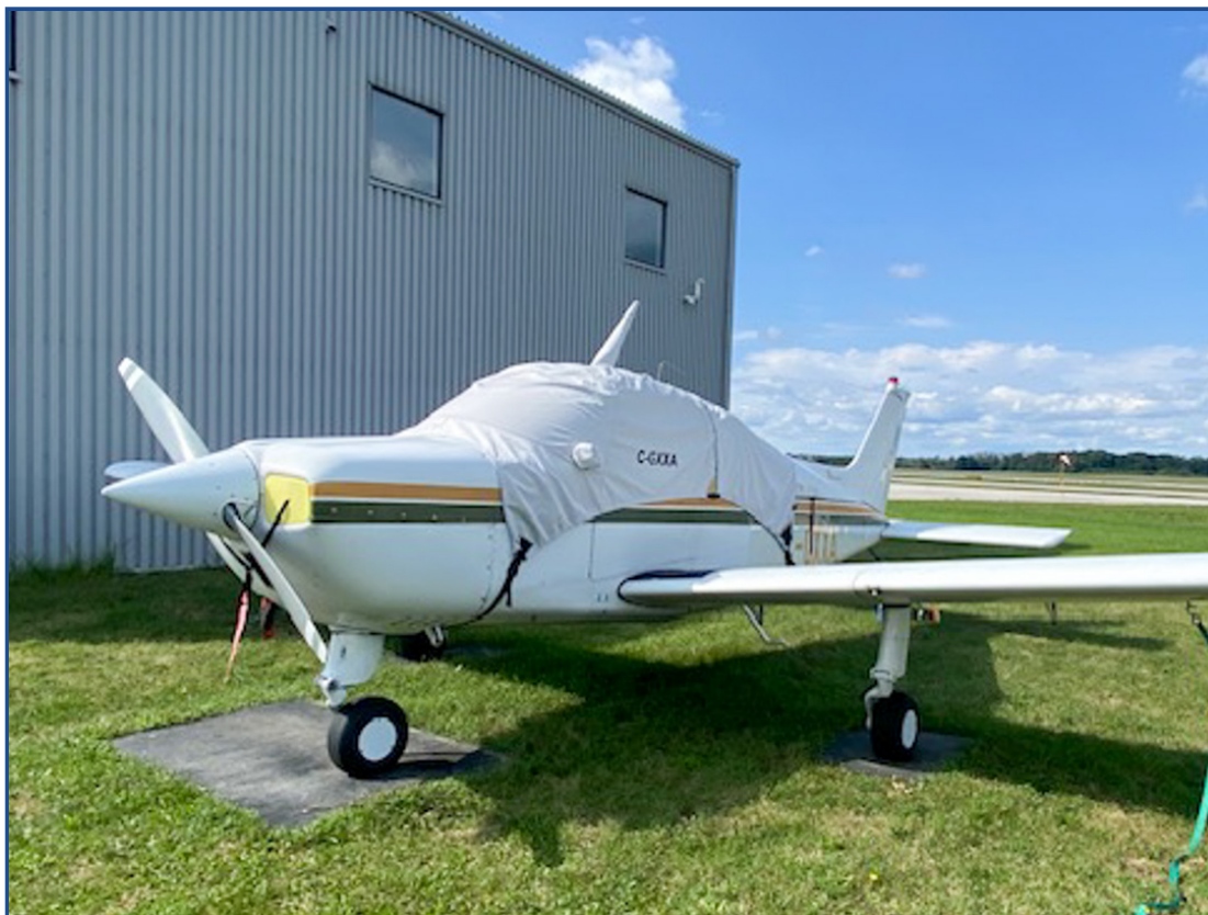
Beech Sport A19 Canopy Cover