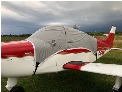
Beech Sundowner Travel Canopy Cover

Travel Covers are made with Silver Solution-Dyed Polyester fabric and only lined over the windshield to save weight. The material is lightweight and more compact for easy stowage in the aircraft. The polyester material is water resistant, but only intended for occasional use outside. We also have an ultra lightweight material available for fitted hangar dust covers. For daily outdoor use, the non-travel Sunbrella Cover is the best choice.