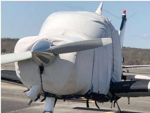
Beech Sundowner Engine Cover