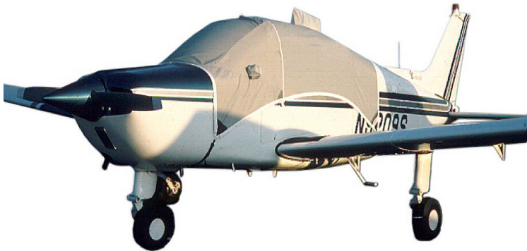
Beech Sport Canopy Cover