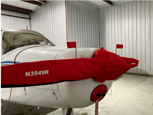
Beech A23 Musketeer Insulated Prop Cover, Engine Plugs

Engine Inlet Plugs are custom fit for your Beech Sport A19 intakes, made with heavy-duty vinyl material, and stuffed with a single block of sculpted urethane foam. Each plug has a zipper that allows the foam to be removed and dried if necessary. Engine plugs have warning flags that are visible from the cockpit or 'remove before flight' streamers sewn onto the face of the plugs. Most plugs are imprinted with the aircraft registration number in black for an extra charge. Storage bag NOT included. Engine plugs may be inserted after flight when the engine is still warm. Engine Inlet Plugs are commonly referred to as Cowl Plugs, Intake Plugs, Cowl Blocks, Engine Blocks, and Engine Bungs.