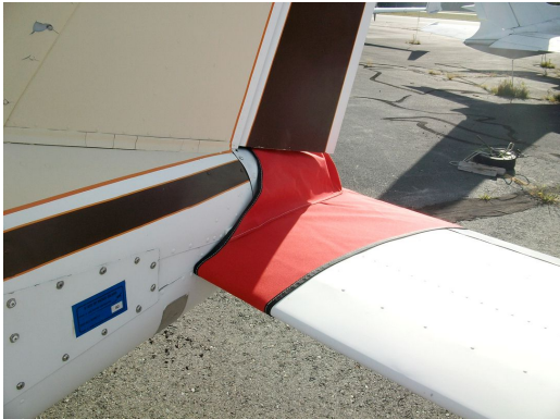
Beech Musketeer Tailcone Cover (Fully Enclosed)