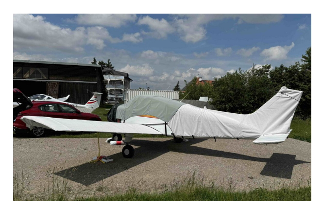
Musketeer A23 Empennage & Wing Covers