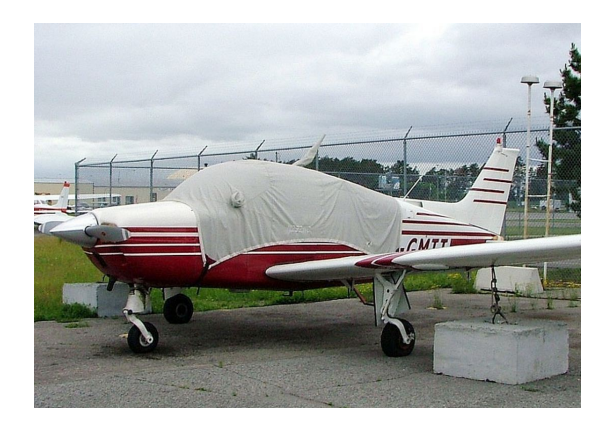
Beech Sierra Canopy Cover