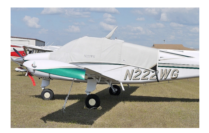
Beech Musketeer Canopy Cover

This cover type is made from Silver Acrylic Sunbrella canvas and is 100% lined with a soft and smooth microfiber. Bruce's Custom Covers developed this material combination especially for aircraft protection. The outer material is medium weight and treated for water resistance, UV resistance and anti-static buildup. The inner lining is a very soft and smooth microfiber to prevent scratching. The material is very reflective, and tests show that the cabin interior temperature can be reduced to near-ambient temperature on the hottest of days. It is water, ice and snow repellent, yet breathable to allow moisture to escape from between the cover and the aircraft surface.