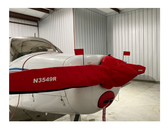
Beech A23 Musketeer Insulated Prop Cover, Engine Plugs

Engine Inlet Plugs are custom fit for your Beech Musketeer A23 intakes, made with heavy-duty vinyl material, and stuffed with a single block of sculpted urethane foam. Each plug has a zipper that allows the foam to be removed and dried if necessary. Engine plugs have warning flags that are visible from the cockpit or 'remove before flight' streamers sewn onto the face of the plugs. Most plugs are imprinted with the aircraft registration number in black for an extra charge. Storage bag NOT included. Engine plugs may be inserted after flight when the engine is still warm. Engine Inlet Plugs are commonly referred to as Cowl Plugs, Intake Plugs, Cowl Blocks, Engine Blocks, and Engine Bungs.