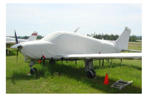
Beech Sierra Engine, Extended Canopy, Empennage, & Wing Beech Sundowner Extended Canopy Cover, Engine, and Wing Covers

This cover type is made from Silver Acrylic Sunbrella canvas and is 100% lined with a soft and smooth microfiber. Bruce's Custom Covers developed this material combination especially for aircraft protection. The outer material is medium weight and treated for water resistance, UV resistance and anti-static buildup. The inner lining is a very soft and smooth microfiber to prevent scratching. The material is very reflective, and tests show that the cabin interior temperature can be reduced to near-ambient temperature on the hottest of days. It is water, ice and snow repellent, yet breathable to allow moisture to escape from between the cover and the aircraft surface.