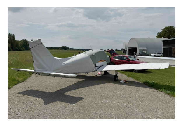
Musketeer A23 Empennage & Wing Covers

WINTER USE MATERIAL - Made with Solution-Dyed Polyester fabric, this option is intended for seasonal use to aid in deicing, rain mitigation, or for occasional travel. The material is lighter and more compact, but more susceptible to UV damage and may have a shorter useful life if used continuously outside than the all-year use material.