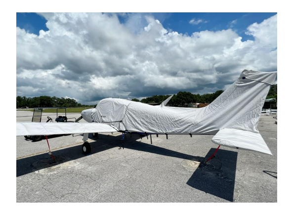
Beech Musketeer A23 Cover Set

WINTER USE MATERIAL - Made with Solution-Dyed Polyester fabric, this option is intended for seasonal use to aid in deicing, rain mitigation, or for occasional travel. The material is lighter and more compact, but more susceptible to UV damage and may have a shorter useful life if used continuously outside than the all-year use material.