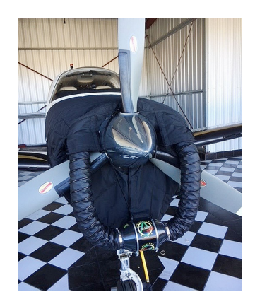
Beech Bonanza 36 Models Insulated Engine Cover

This cover type is made from Silver Acrylic Sunbrella canvas and is 100% lined with a soft and smooth microfiber. Bruce's Custom Covers developed this material combination especially for aircraft protection. The outer material is medium weight and treated for water resistance, UV resistance and anti-static buildup. The inner lining is a very soft and smooth microfiber to prevent scratching. The material is very reflective, and tests show that the cabin interior temperature can be reduced to near-ambient temperature on the hottest of days. It is water, ice and snow repellent, yet breathable to allow moisture to escape from between the cover and the aircraft surface.