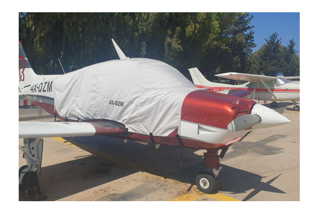
Beech Sierra Extended Canopy Cover