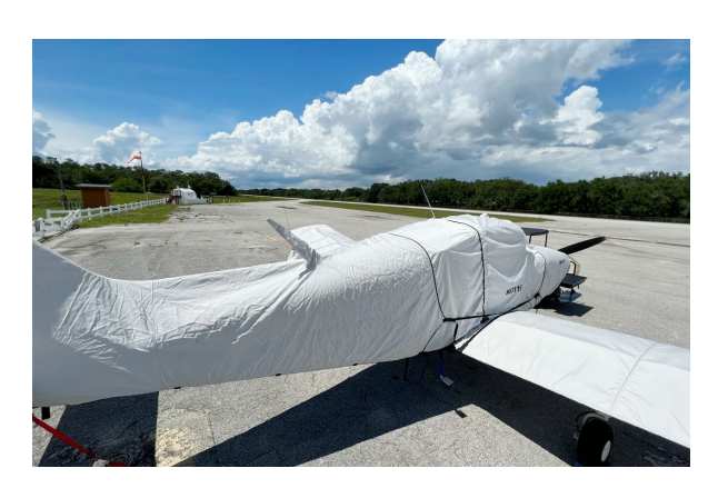
Beech Musketeer A23 Cover Set