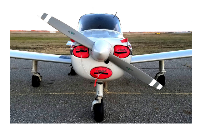
Beech Musketeer Engine Inlet Plugs

plugs have warning flags that are visible from the cockpit or 'remove before flight' streamers sewn onto the face of the plugs. Most plugs are imprinted with the aircraft registration number in black for an extra charge. Storage bag NOT included. Engine plugs may be inserted after flight when the engine is still warm. Engine Inlet Plugs are commonly referred to as Cowl Plugs, Intake Plugs, Cowl Blocks, Engine Blocks, and Engine Bungs.