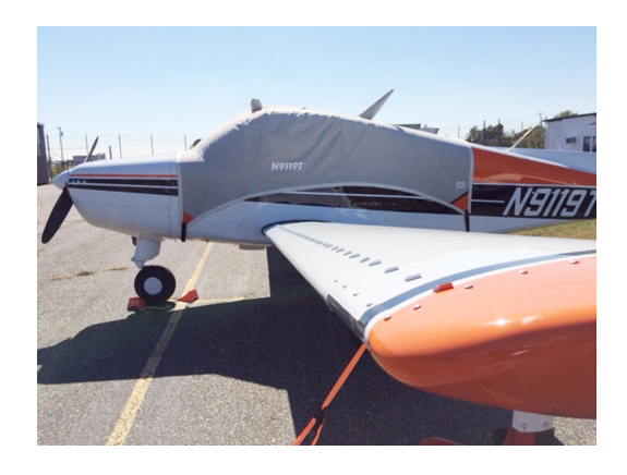
Beech Musketeer Canopy Cover

This cover type is made from Silver Acrylic Sunbrella canvas and is 100% lined with a soft and smooth microfiber. Bruce's Custom Covers developed this material combination especially for aircraft protection. The outer material is medium weight and treated for water resistance, UV resistance and anti-static buildup. The inner lining is a very soft and smooth microfiber to prevent scratching. The material is very reflective, and tests show that the cabin interior temperature can be reduced to near-ambient temperature on the hottest of days. It is water, ice and snow repellent, yet breathable to allow moisture to escape from between the cover and the aircraft surface.