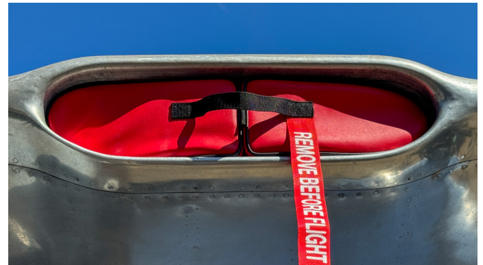
Douglas A26 Invader Oil Cooler Inlet Plugs