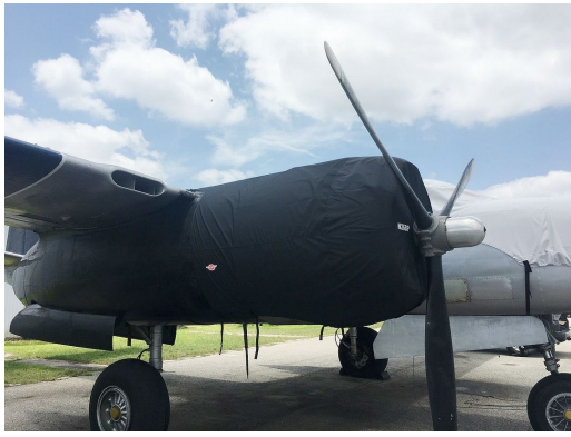
Douglas A-26 Engine Cover