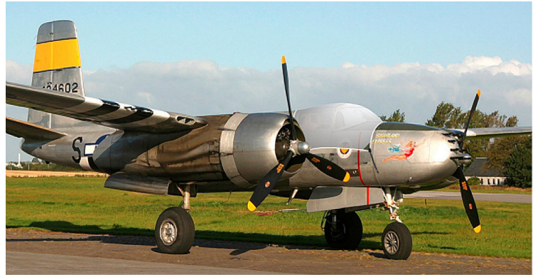
A-26 Invader Cockpit Cover (Illustration)