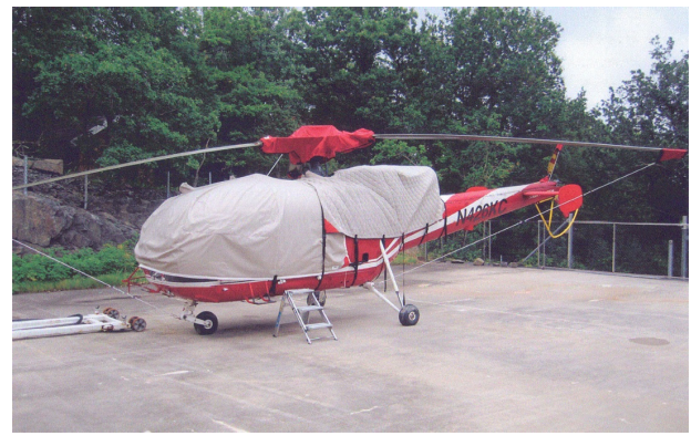
Alouette III Bubble, Rotor Hub & Engine Covers, Blade Tie-Downs